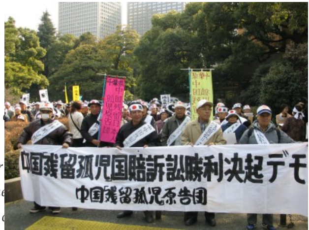
PIC Japanese WW II orphans returning from China march in protest in Tokyo, March 2, 2005.

[Modern wars always produce large numbers of orphans, nearly all from the invaded nation's China War of 1937-45 is no exception. That war generated not only hundreds of thousands of Chinese orphans, but also large numbers of orphans of Japanese and Korean settlers in Northeast China. This article examines the fate of a subgroup of orphans, the