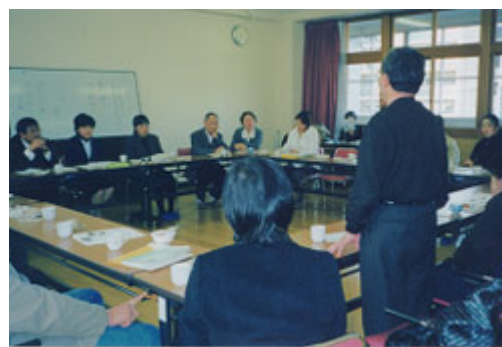
A scene from a Japanese language class for zanryu koji, Kyoto, 2005.

In August 2004, the Japanese Ministry of Health and Welfare sent questionnaires to 1,846 orphans who had filed lawsuits. Among them, 1,692 responded. Just one percent indicated that they were comfortable with the Japanese language. Indeed, the wall of the Japanese language prevents orphans from becoming economically independent. Hence, most of the aged orphans are forced to rely on welfare after arriving in Japan. In Osaka, for example, an orphan who is over sixty and has one dependent, receives a monthly pension of about 120,000 yen [less than 1,200 dollars]. If living alone, the monthly pension is only about 80,000 yen [800 dollars]. They are prohibited from sending part of their pension to family members remaining in China. And if they temporarily return to China, for example to pay respects to the tombs of their adoptive parents, they are not paid during the time they are away from Japan.