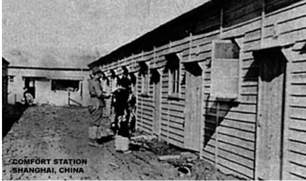
Military Comfort Station, Shanghai