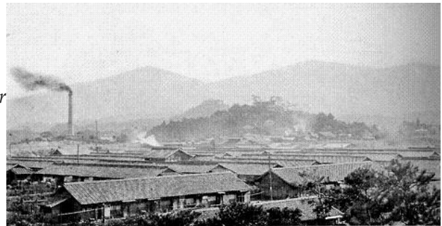
Undated photo of Aso Yoshikuma coal mine, Fukuoka