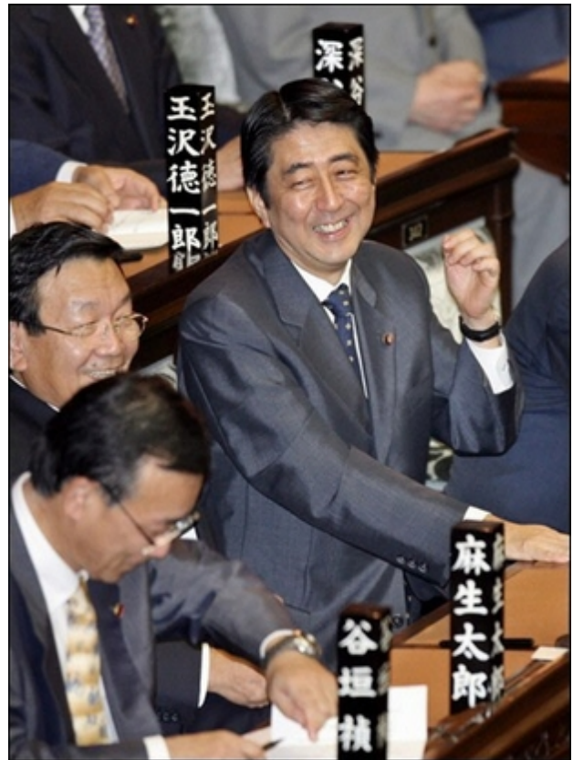
Prime Minister Abe at the Diet

however, clearly has no problem with the proposition that the recruitment of "comfort women" was forcible "in the broad sense of the word", and feels no historical responsibility for this, since he has made it clear that he and his government will not apologise whatever the outcome of the US Congressional resolution. [4] His Foreign Minister Aso Taro, has also attacked the US resolution, saying that it is "not based on the facts". [5]