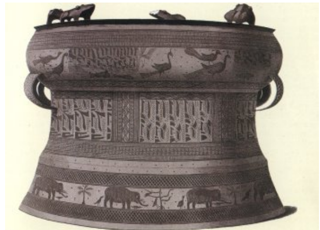
Dongson drum probably made in Vietnam circa 200 A.D.

the south passing through Vietnam, Malaysia, Sumatra, Java, Bali, Sumbawa, etc. That other technical information, like the use of braced ridge tiles, [7] could also have spread along with bronze working cannot be doubted. Some prehistorians are currently researching the presence of boat-coffins, found equally in Wuyishan, one of the highest places in northern Fujian, in the Niah cave (northern Borneo), and in several places in the Philippines.[8] Generations of students of mythology have also studied the similarities found among the various folklores of river-valley dwellers.