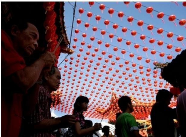
Ethnic Chinese offer prayers at a temple in Kuala Lumpur, February 2007

world, beyond the Gulf of Bengal (which we know had been an area of exchange between Sri Lanka and Burma, as well as between Bengal and Arakan), as well as towards the Melanesian world (which we know begins in Indonesian itself, in Maluku, Irian and Timor). Yet, by contrast, it excludes all relations with the Chinese world. No thought is given here to trying to rethink over the centuries [in the longue durée ] the possible contacts between south China and Southeast Asia; at best, historical consideration was confined to the recently formed Chinatowns , which in turn were deliberately seen as settlements of “foreigners”, and thus as an epiphyte...[3]