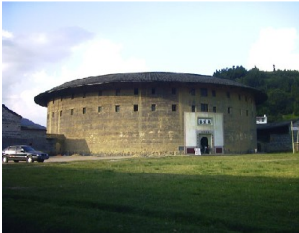
Hakka dwelling in southern Fujian

Sung period, who had settled in southern regions. Their “difference” from other such groups, it used to be said, was in their wonderful ability to preserve their original traditions (and dialect). But today the tendency is to view them as “aborigines”, as people of the South, who had been progressively but incompletely acculturated by Han civilisation. [9] And it is very true that certain of their customs (for example, double funerals) are better explained by the existence of an “old Southeast Asian stock” than by any import from the North. [10]