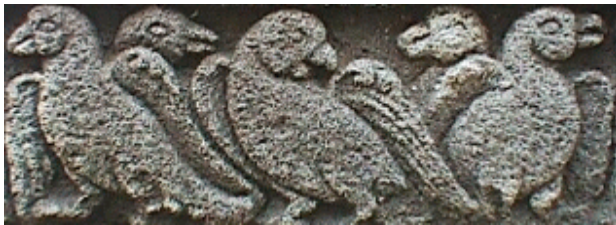
Borobudur / Detail of frieze depicting parrots

From the tenth and eleventh centuries, we can make out certain changes. In China, the period known as the Five Dynasties (907-960 CE) was characterised by a great level of autonomy in the southern regions, which took advantage of the temporary imperial crisis. Fujian, known for some decades as the kingdom of Min, [13] took off economically, little by little preparing itself to become one of the early economic motors of Southeast Asia; while under the Southern Han (Nan Han) the Guangdong region experienced enormous development, notably in regard to metallurgical production. In the archipelago that later became the Philippines, we see the emergence of the gold-rich site of Butuan (on the north coast of Mindanao), which starts to exchange Chinese ceramics for its gold. On Java, the centre of gravity moves from the middle to