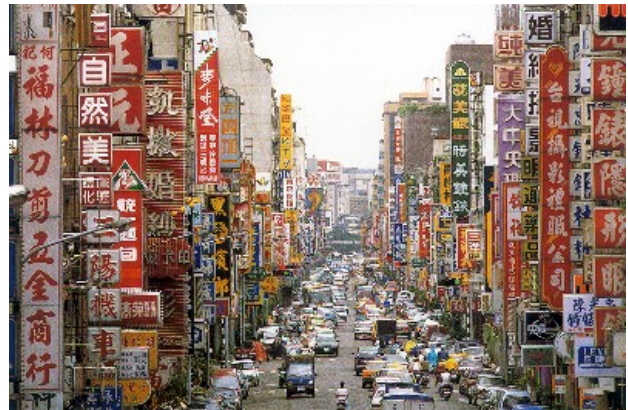
Postcard image of Taiwan

from the Chinese continent, it is quite fascinating to compare their evolution. Both were initially occupied by non-Chinese populations, in the first case by Thais especially and by Austronesians in the second, so we could say that, from a certain perspective, they were both at base “Southeast Asian”. But if Hainan was Sinicised quite early and has never ceased to form part of the continental system, Taiwan was not really occupied before the seventeenth century, above all by farmers from Fujian; and we know what its recent evolution has been.