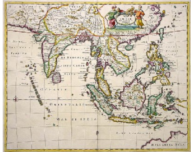
Map of the “East Indies,” circa 1662

But this sense of Southeast Asian “centring” is not all that new. If the names in current use are quite recent, it was still a very long time ago that the West first identified the totality of the “East Indies”—that space which the Chinese for their part had designated for long centuries as the Nanyang or “South Seas”—as a sort of “party-wall” that both connects and separates the two giants, a zone where Chinese and Indian influences had historically met (from whence the fruitful concept of “Indochina”) and as a region of lesser political density, where structures were less rigid and where they could hope to find an advantageous zone of influence.