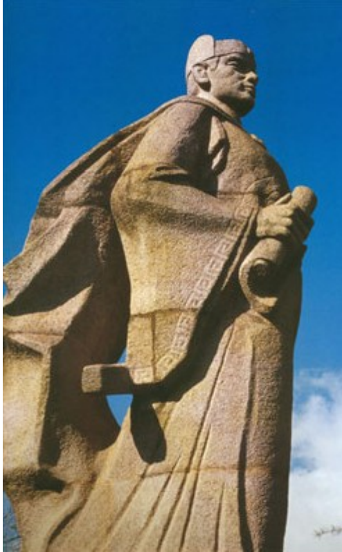
Statue of Chinese admiral Zheng He (1405-1433)

During the first decades of the fifteenth century, the famous expeditions by Admiral Zhenghe not only crossed the South Seas but went as far as India, Mecca, and even Mogadishu in Africa. They were broken off after 1436, and this interruption has generally been interpreted as a Chinese desire to “withdraw”. This still remains to be proven, for the stopping of the great State expeditions in no way meant Chinese emigration ceased. We can indeed wonder if, fundamentally, the Chinese had not moved on very much earlier to a system of private trading (so vaunted in our days), while the West still remained entangled in its “companies”, who made war on “freebooters” for a further two or three centuries.