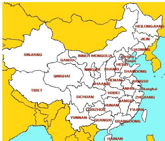
Map of administrative divisions in China

At this point, we can affirm that wanting to understand Southeast Asia without integrating a good deal of southern China into our thinking is like wanting to give an account of the Mediterranean world after removing Turkey, the Levant, Palestine, and Egypt. By this new “centring”—or rather, by restoring the centring—geography can and should help us to go beyond the received ideas that a certain style of history wants to us preserve, by insisting on staying too close to the facts (or to certain facts).