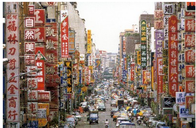
Postcard image of Taiwan

from the Chinese continent, it is quite fascinating to compare their evolution. Both were initially occupied by non-Chinese populations, in the first case by Thais especially and by Austronesians in the second, so we could say that, from a certain perspective, they were both at base “Southeast Asian”. But if Hainan was Sinicised quite early and has never ceased to form part of the continental system, Taiwan was not really occupied before the seventeenth century, above all by farmers from Fujian; and we know what its recent evolution has been.