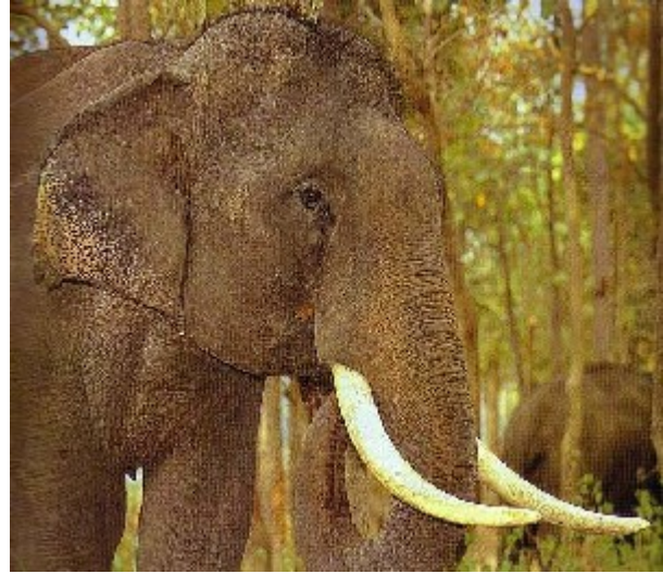
Elephant in southern Yunnan

length, at Phuket (now in Thailand) just as at Perak, on the outskirts of Kuala Lumpur just as at Bangka and Belitung (Billiton). We find volcanic activity in certain parts of Taiwan and Hainan, and earthquakes might damage Fujian or Hong Kong just as easily as the Philippines or Burma. It is also a commonplace that this whole region falls under the monsoon cycle and experiences typhoons, while botanists and zoologists, in parallel with each other, stress the fact that the flora and fauna of southern China bears great analogies to the light forests of Indochina, and that in earlier times elephants were common in the North and the South. Just as in Hainan, the coastal regions of southern China were also covered by tropical forests, the point being that forest felling began here much earlier than further South. Just as with Europe's Mediterranean, then, the opportunity exists here for historians to study the differential retreat of the forests, occurring much earlier in the most economically developed countries: in the Muslim world retreating to the west, in China to the south.