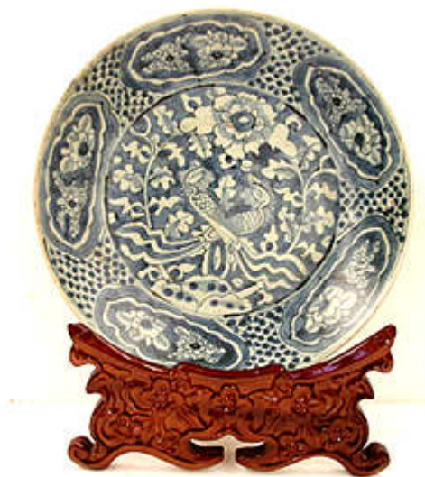
Early Ming plate found on shipwreck near Ternate, Moluccas, eastern Indonesia