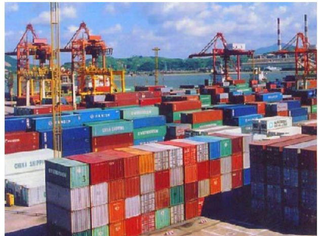
Containers at Fuzhou port

From the sixteenth century, things changed a bit, partly due to the presence of Europeans—the Portuguese, and then the Dutch and English—but only in part for this reason. Little by little, Fujian’s primacy was receding and Canton taking back her former place, but under a less liberal system: 13 hang or guilds, were set up there in 1557, and in 1720 they would begin the Kohong system that allowed Chinese mandarins better control of Westerners. One might reflect from this that, whenever China opens up via Canton, it is always done less widely and in a more controlled fashion than through Fujianese ports.