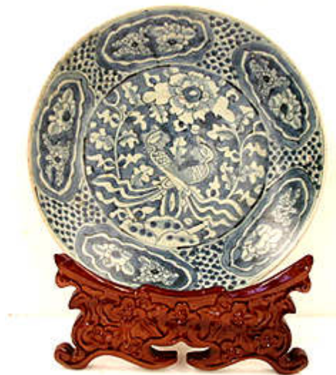
Early Ming plate found on shipwreck near Ternate, Moluccas, eastern Indonesia