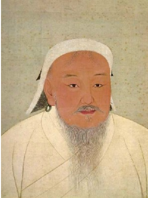
Painting of Kubilai Khan

The Mongol conquest is still a rather poorly understood phenomenon, but it is clear that, on leaving Central Asia, Genghis Khan and his successors wanted to organise a sort of world system that would have integrated not only China, eastern Europe, Iran, and India, but also all the islands and countries at its eastern periphery, including Japan, Vietnam, Champa, Burma, and Java. The two centuries that followed would see the emergence of new centres of gravity, the take-off of numerous port cities, and above all the development of an Eastern maritime route, linking the ports of Fujian by various stops to Luzon, Mindoro, the Visayas, and, beyond Mindanao, to Brunei in one direction, and Sulu and Maluku in the other. On