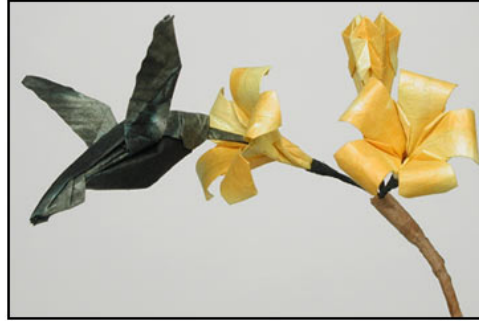
Lang's trumpet vine blossom

education—kindergarten. The curriculum included three kinds of paper folding—“The Folds of Truth,” “The Folds of Life,” and “The Folds of Beauty”—to teach children principles of math and art. The kindergarten movement was embraced around the world, including in Japan, where Fröbel’s simple folds merged with traditional origami. Japanese magicians of the time also began doing paper tricks as part of their conjuring. By the eighteen-sixties, Japan’s isolationism was ending, and in the following decades those magicians travelled to Europe and the United States to perform. Suddenly, the kindergarten exercise appeared mysterious and wonderful. A square of ordinary paper creased and crinkled could come to life as a flapping gull; a sheet of parchment could take shape as a lion or a swallowtail. Professional magicians in Europe and the United States loved origami, and a number of them wrote books about it. In 1922, Harry Houdini published “Houdini’s Paper Magic: The Whole Art of Performing with Paper, Including Paper Tearing, Paper Folding and Paper Puzzles.” (He regularly did a trick known as “the troublewit,” turning a piece of paper into an endless number of different shapes without any cuts.) In 1928, the stage magicians William Murray and Francis Rigney published “Fun with Paperfolding,” with chapters on square folding, diagonal folding, and a complete paper-folding stage routine titled “How Charlie Bought His Boat.”