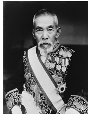
Inukai Tsuyoshi, Ogata's maternal grandfather served as Prime Minister

( http://www.amazon.com/Turbulent-Decade-Confronting-Refugee-Crisis/dp/0393929221/sr=8-4/qid=1172247570/ref=sr_1_4/105-9340252-4770834?ie=UTF8&s=books )