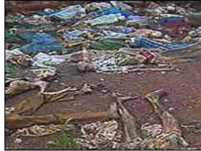
Victims of Rwandan massacre

The new framework for dealing with large refugee crises—containment in camps and ‘safe havens’, quickly followed by repatriation—was also applied in the Great Lakes region of Africa, following the Burundian coup and the massacre of up to 800,000 predominantly Tutsi civilians in Rwanda. One million mainly Hutu refugees moved into what was then Zaire in 1994, and UNHCR immediately appealed for military help. French troops were there from the start, shortly followed by US Army logistical support—Operation Support Hope—then Swedish and German troops, and the Japanese Self-Defence Force (a minor breakthrough in Japan’s remilitarization, which Ogata celebrates). Setting up and running the camps required the support of Mobutu’s regime, which he gave with a view to strengthening his hand in the region and in international negotiations. [7] Ogata argued that ‘From the outset it seemed obvious that return was the main solution. The refugee outflow was too massive for the people to be absorbed by neighbouring countries or to be resettled in third countries.’ [8] This policy was now becoming so entrenched that it no longer seemed necessary for UNHCR even to ask whether repatriation was in the best interests of the refugees. Sporadic massacres of displaced civilians within Rwanda seem only to have slightly delayed the apparently inevitable return.