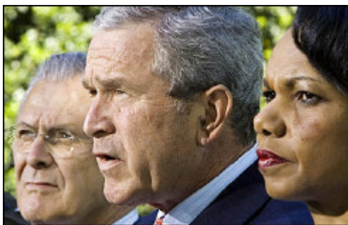
Former US Secretary of Defense Donald

In 2005, deployments at home and abroad were in a state of considerable flux. This was said to be caused both by a long overdue change in the strategy for maintaining our global dominance and by the closing of surplus bases at home. In reality, many of the changes seemed to be determined largely by the Bush administration's urge to punish nations and domestic states that had not supported its efforts in Iraq and to reward those that had. Thus, within the United States, bases were being relocated to the South, to states with cultures, as the Christian Science Monitor put it, "more tied to martial traditions" than the Northeast, the northern Middle West, or the Pacific Coast. According to a North Carolina businessman gloating over his new customers, "The military is going where it is wanted and valued most."