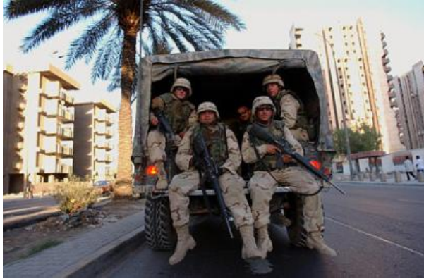
U.S. troop in Iraq

Interestingly enough, the thirty-eight large and medium-sized American facilities spread around the globe in 2005 -- mostly air and naval bases for our bombers and fleets -- almost exactly equals Britain's thirty-six naval bases and army garrisons at its imperial zenith in 1898. The Roman Empire at its height in 117 AD required thirty-seven major bases to police its realm from Britannia to Egypt, from Hispania to Armenia. Perhaps the optimum number of major citadels and fortresses for an imperialist aspiring to dominate the world is somewhere between thirty-five and forty.