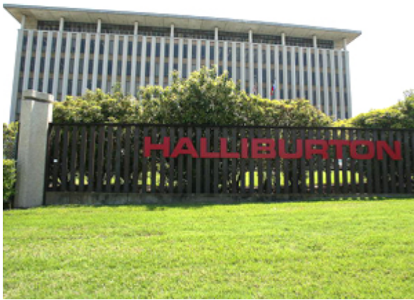
Halliburton Corporation's Houston offices

The report similarly omits bases in Afghanistan, Iraq (106 garrisons as of May 2005), Israel, Kyrgyzstan, Qatar, and Uzbekistan, even though the U.S. military has established colossal base structures in the Persian Gulf and Central Asian areas since 9/11. By way of excuse, a note in the preface says that "facilities provided by other nations at foreign locations" are not included, although this is not strictly true. The report does include twenty sites in Turkey, all owned by the Turkish government and used jointly with the Americans. The Pentagon continues to omit from its accounts most of the $5 billion worth of military and espionage installations in Britain, which have long been conveniently disguised as Royal Air Force bases. If there were an honest count, the actual size of our military empire would probably top 1,000 different bases overseas, but no one -- possibly not even the Pentagon -- knows the exact number for sure.