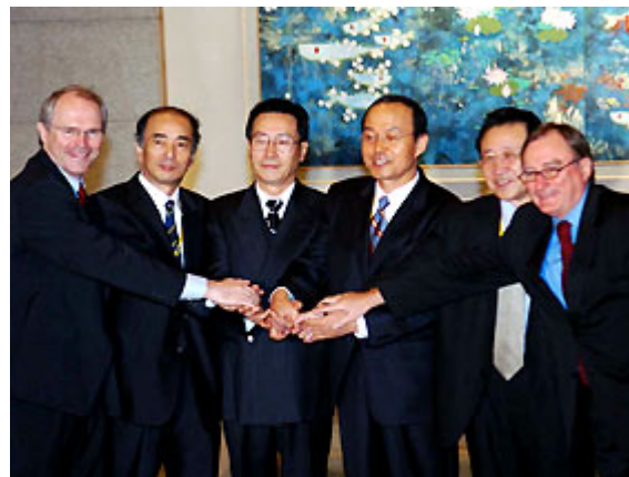
Members of the 4th round of six party talks, from September 2005.

Already there is uneasiness about even the next phase – which includes “provision by the DPRK of a complete declaration of all nuclear programs and disablement of all existing nuclear facilities, including graphite-moderated reactors and reprocessing plant.” Energy assistance alone might not be enough to make North Koreans deliver, unless substantial – and more or less irreversible – progress is made on the tracks of security provision and diplomatic normalization.