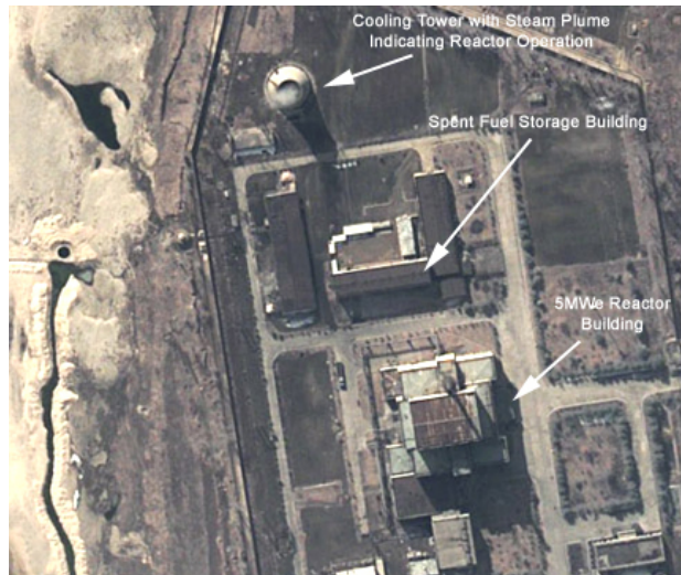
5 MWE REACTOR COMPLEX AT YONGBYON, DPRK

economy and energy cooperation, and Northeast Asian peace and security.[15] The parties pledged to “take positive steps to increase mutual trust” and the directly related parties to “negotiate a permanent peace regime on the Korean peninsula.”