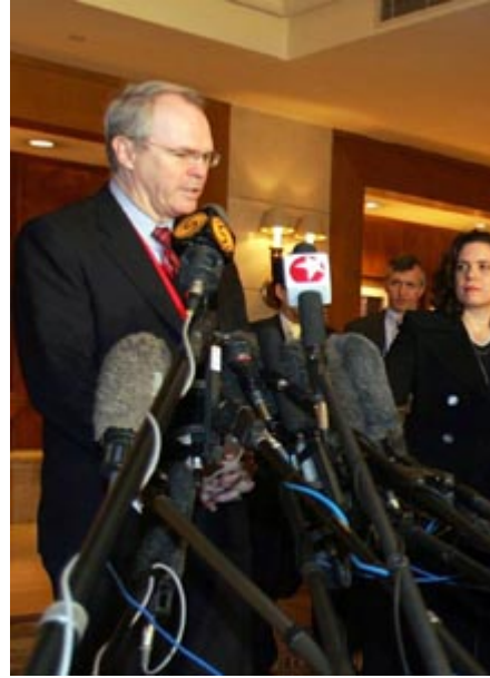
Christopher Hill announcing tentative agreement, Feb. 12

Whether these matters had all, like the Macao Bank matter, been amicably resolved behind the scenes remained to be seen.