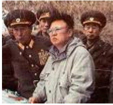
Kim Jong Il and his generals

unnecessary. That would be a long-term process, but it was beginning.