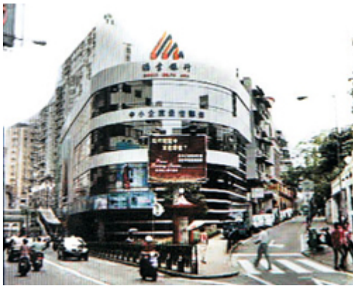
Banco Delta Asia in Macau

(2) BDA: the Macao bank counterfeit charges - so important in 2005-6 as to have been the principal cause of a twelve month-long crisis. Christopher Hill, the chief US delegate in Beijing, announced as the delegates were about to disperse that this dispute would be settled "within 30 days," which could only mean that it had already been settled.[17]