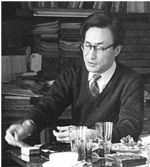
Maruyama Masao, 1959

modernization. Nor was this simply a matter of Japan's scientific, technological and productive capacity being inferior to that of the United States and the countries of Europe. Total war clearly exposed problems of organization and mentality, as well, beginning with intense rivalry among, and nepotism within, the Army, Navy, and civilian bureaucracy. These realities of wartime society were a far cry from the ideal types of modern rationalism that were envisioned by intellectuals. Moreover, owing to the democratization policies of American occupation forces under the command of General Douglas MacArthur, the supposedly "overcome" ideal of liberal democracy experienced a revival.