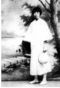
Image 3: 1926 photograph of Xu Guangping (1898-1968)

Following Chiang Kai-shek's April 1927 coup in Shanghai and the massacre of Communist sympathizers that followed, Lu Xun lived in constant fear of political assassination or capture by the Nationalists until his death. Although Inoue's play ostensibly takes place from August 23 to September 16, 1934, he integrates and conflates events that occurred in the years 1930, 1931, 1932 and 1934. [32]