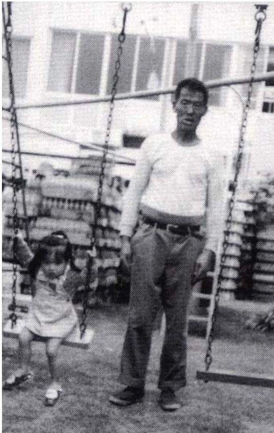
'Uncle' in Kumamoto

'Uncle's' life had been, indeed, why on earth he had even been born. An exile from his homeland, 'Uncle' had lived out his life quietly in the shadows. When he was suddenly felled by a stroke, he tried to brush away the helping hands, surely signalling that he had had enough of living.