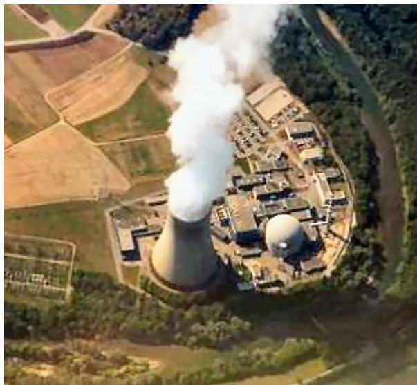
Nuclear power station at Leibstadt, Switzerland

Nuclear power stations now produce about 17% of the world's electricity. In France and Lithuania nearly 80%, in Britain about 25%. Popular attitudes to nuclear power in other countries vary from apathy and indifference to fear and loathing. For the most part it would be fair to say, that as long as they don't contaminate the environment, and there are no blackouts, nuclear reactors must be a good thing. What has been the record of the countries that have been using nuclear power for decades?