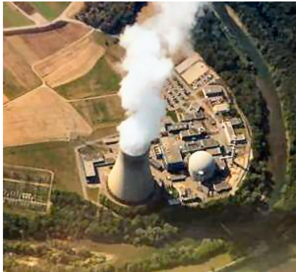
Nuclear power station at Leibstadt, Switzerland

Nuclear power stations now produce about 17% of the world's electricity. In France and Lithuania nearly 80%, in Britain about 25%. Popular attitudes to nuclear power in other countries vary from apathy and indifference to fear and loathing. For the most part it would be fair to say, that as long as they don't contaminate the environment, and there are no blackouts, nuclear reactors must be a good thing. What has been the record of the countries that have been using nuclear power for decades?