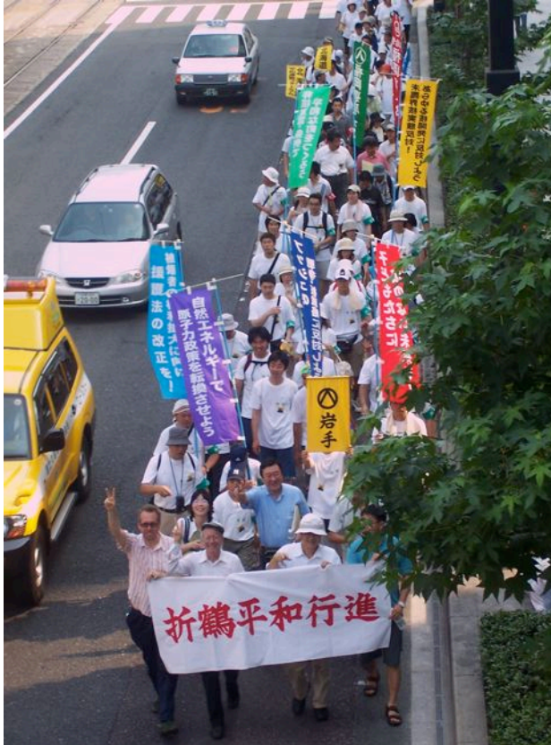
Anti-nuclear march in Japan, Aug. 2006.

Kakumihama is a wild spot. Even in summer there are only well wrapped walkers on the beach, but on a clear day, the Kashiwazaki cluster can be seen on the horizon to the south. This coast reminded me of the shores of East Anglia around Southwold, Dunwich and Warbleswick, in Suffolk, looking towards the great, grey slab of the Sizewell nuclear complex. Japan and Britain are twin souls when it comes to planting nuclear power stations at the seaside. Every single genpatsu is on the coast, from Tomari on the western coast of Hokkaido, to the far south coast of Kyushu at Sendai. The French don't bother about hiding them away. There they are right next to the TGV line between Paris and Lyon. The only serious difference might be the geology — most of Japan is seismic, prone to earthquakes or tremors, and the coast is no exception, another focus of the anti-genpatsu movement.