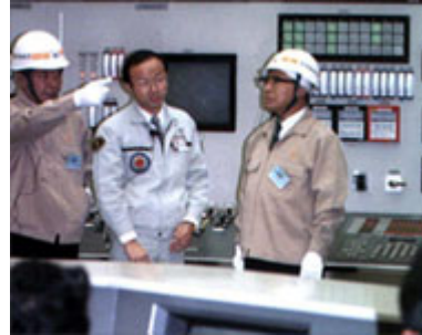
Monju reactor was shut down in 1995 after a serious accident.

out flowed liquid sodium which, although it wasn't radioactive, burst into flames at around 1500°C, melted some of Monju's steel structures, then solidified into several tonnes of useless, metallic gunk.