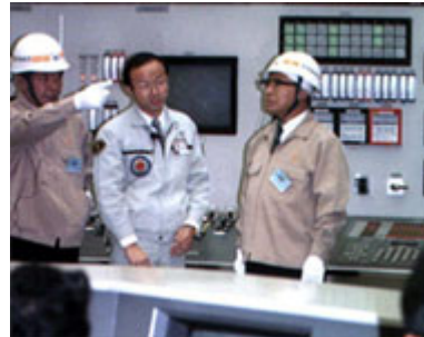
Monju reactor was shut down in 1995 after a serious accident.

out flowed liquid sodium which, although it wasn't radioactive, burst into flames at around 1500°C, melted some of Monju's steel structures, then solidified into several tonnes of useless, metallic gunk.