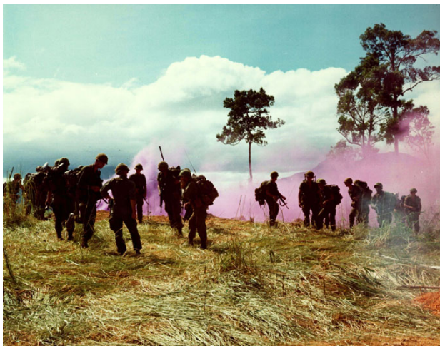
US counterinsurgency operation in South Vietnam

New and innovative counterinsurgency tactics. The cottage industry of counterinsurgency tactics is old and deceptive. When the US military has been periodically tasked to reinvent them – the last great surge in that industry was at the JFK School in Fort Bragg in the 1960's – it has no choice but to pretend that counterinsurgency tactics can succeed where no political consolidation in the government has yet been achieved. New counterinsurgency tactics cannot save Iraq today because they are designed without account for the essence of any "internal war," whether an insurgency or a civil war.