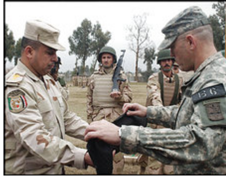
U.S. officer hands flag to Iraqi commander during a 2006 handover ceremony in Mosul

I know of no historical precedent to suggest that any of them will succeed. The problem is not the competency of Iraqi forces. It is political consolidation and gaining the troops' loyalties to the government and their commanders as opposed to their loyalties to sectarian leaders, clans, families, and relatives. For what political authority are Iraqi soldiers and police willing to risk their lives? To the American command? What if American forces depart? Won't they be called traitors for supporting the invaders and occupiers? Will they trust in a Shi'ite-dominated government and ministry of interior, which is engaged in assassinations of Sunnis? Sunni Arabs and Kurds would be foolish to do so, although financial desperation has driven many to risk it. What about to the leaders of independent militias? Here soldiers can find strong reasons for loyal service: to defend their fellow sectarians, families, and relatives. And that is why the government cannot disband them. It has insufficient loyal troops to do so.