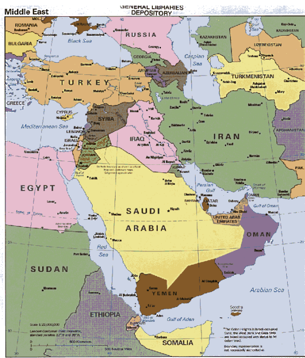
Middle East and Central Asia

operations having the aim of trying to reverse this reality, insisting that we can now "do it right," need to be treated with the deepest of suspicion. That includes the proposal to sponsor the breakup by creating three successor states. To do so would be to preside over the massive ethnic cleansing operations required for the successor states to be reasonably stable. Ethnic cleansing is happening in spite of the US military in Iraq, but I see no political or moral advantage for the United States to become its advocate. We are already being blamed as its facilitator.