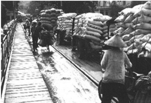
Supplying NLF forces in South Vietnam

colonel, who has served a year in Iraq and visited it several other times, Hashim offers a textured study that struck me again and again as a rerun of an old movie, especially where it concerned US training of Iraqi forces.