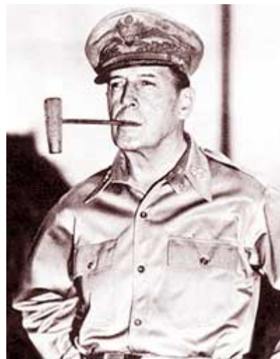
Gen. Douglas MacArthur

There was yet another reason. Weller had been MacArthur's nemesis ever since the correspondent escaped from Singapore and Java to Australia in early 1942, and came under the iron hand of censorship while reporting the struggle up the Pacific islands. The general would have taken Weller's entry into Nagasaki as a personal affront as much as a defiance of his authority.