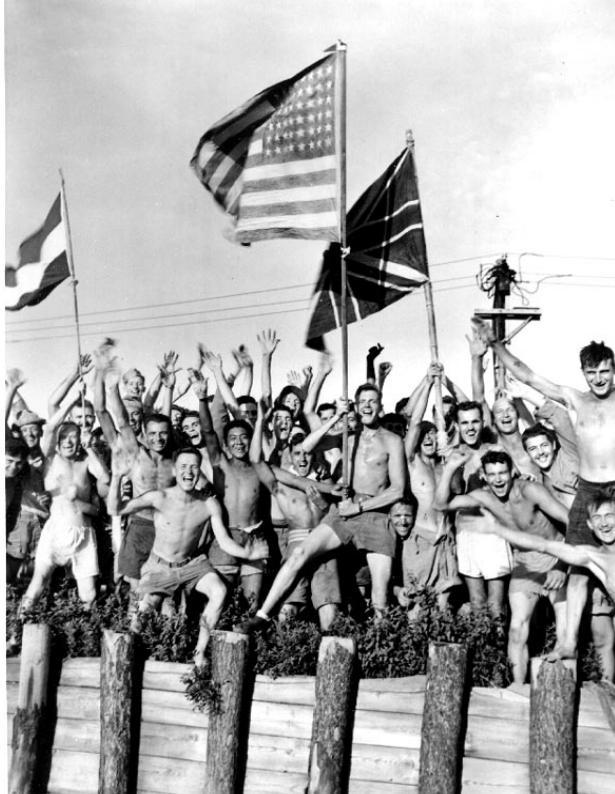
Photo # 80-G-490444 Released POWs at Aomori, 29 Aug. '45 Allied POWs following release in Aomori, August 1945