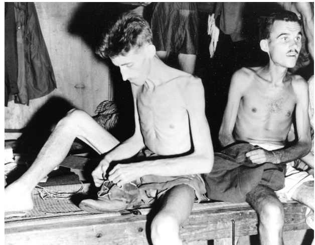
Photo # 80-G-490446 Released POWs at Aomori, Japan, 29-30 Aug. '45

contained a dangerous radiation all their own, the unpredictable half-life of truth. Difficult as it may be to parse MacArthur’s motivations, it’s also hard to think of one good reason why the U.S. government might’ve wanted to encourage any correspondents outside their guidance to venture into the nuclear sites. After Wilfred Burchett’s one-day foray into Hiroshima, Weller was unknowingly sending his dispatches into a hornets’ nest in Tokyo, where he hadn’t a prayer of success. And after Truman’s confidential memorandum demanding silence about the bomb from all U.S. media, one week into Weller’s odyssey, anything that got through the censors would’ve still probably been silenced back home.