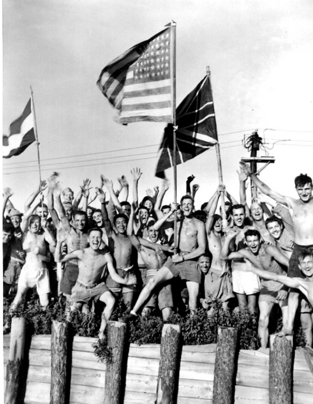
Released POWs at Aomori, 29 Aug. '45 Allied POWs following release in Aomori, August 1945