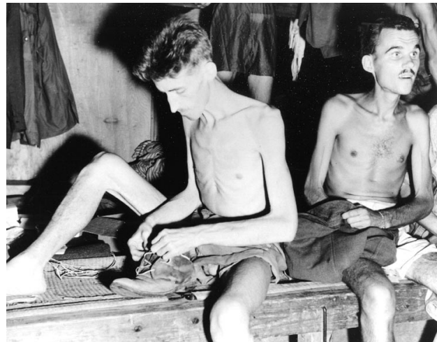
Photo # 80-G-490446 Released POWs at Aomori, Japan, 29-30 Aug. '45

contained a dangerous radiation all their own, the unpredictable half-life of truth. Difficult as it may be to parse MacArthur’s motivations, it’s also hard to think of one good reason why the U.S. government might’ve wanted to encourage any correspondents outside their guidance to venture into the nuclear sites. After Wilfred Burchett’s one-day foray into Hiroshima, Weller was unknowingly sending his dispatches into a hornets’ nest in Tokyo, where he hadn’t a prayer of success. And after Truman’s confidential memorandum demanding silence about the bomb from all U.S. media, one week into Weller’s odyssey, anything that got through the censors would’ve still probably been silenced back home.