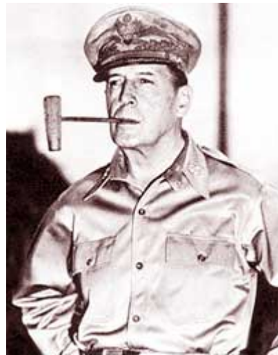
Gen. Douglas MacArthur