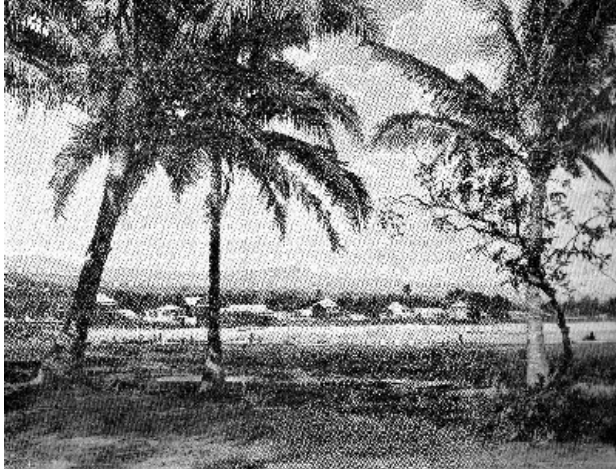
"Apia, Samoa"; the second illustration under Samoa in World of Today , Vol 4, 1907, p. 183.