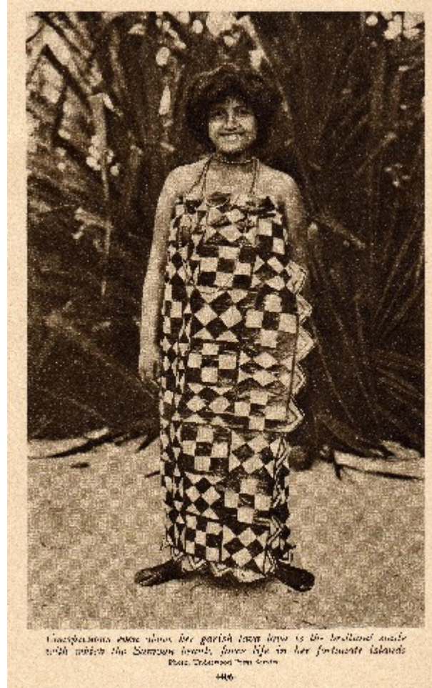
Photogravure, in Frank Fox, “Samoa; a paradise in the South Seas”, People of all nations, Volume 6, p.4406.

The opening photographs of Frank Fox’s 1926 article on Samoa included eight individual and group portraits, with several doubling to provide a view of a fale , the braiding of ‘ afa (coconut fibre or sennit) or siapo (tapa) making. [28] Two portraits doubled as voyeuristic poses. In three portraits, men and women were shown holding weapons. Two photographs of canoes, and two of dancing completed this introductory set. The following ten pages of colour plates and photogravure—where content and message was more pronounced because of the use of special paper, processes and colour—included eight individual or group portraits with two doubling as an ‘ ava (kava) ceremony and a display of weapons, tuiga , and the to’oto’o ma le fue (staff