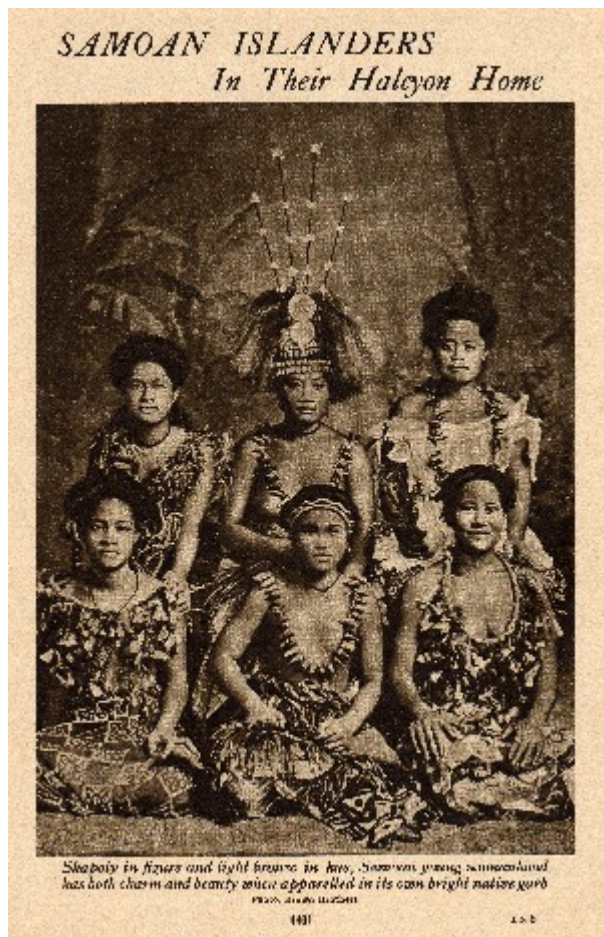
Opening illustration to an eight-page photogravure section on clay-based paper in Frank Fox, “Samoa; a paradise in the South Seas”, People of all nations, Volume 6, 4401 .

understanding of the distant colonial world. [27] Was it Samoa specifically that the reader looked at or “natives” generally? This suggests historians, noting Hammerton’s concerns, should analyse Samoan photography in the context of a globalising, photographic and homogenised “other”.