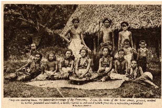
A staged performance of kava making, including elements of documentary, portraiture and ethnographic imaging, this was often published; see New World of Today , Volume 8, p.165; and as a photogravure, see, People of all nations , Volume 6, p.4402.

The four other photographs of Samoa in The World of Today in 1907 depicted Apia and its harbour front, a posed group portrait along the coast, a studio portrait of a woman with one breast exposed and captioned "Samoa taupou or village virgin", and a posed group portrait of children and youths outside a village fale (house) captioned "girls making kava". The youths were not making kava, although the