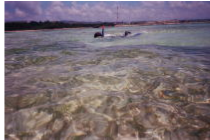
The dugong habitat with Camp Schwab in the background

the Okinawans had decided to accept the construction of the base in the dugong habitat despite the MoE warnings.