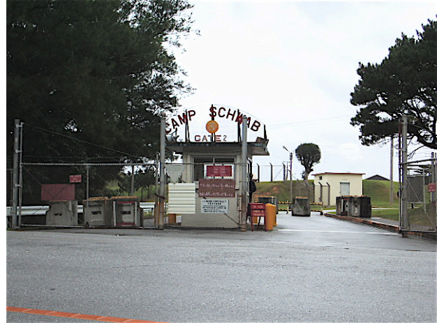
Entrance to Camp Schwab

guidelines and the research conducted by the US government and military and the Japanese government as means of contesting environmental and cultural politics. It will examine the implications of the Japan Environmental Guide Standards (JEGS), which was created by the US government and military and the Japanese government in 2001 as the “sole source of guidance for environmental compliance, requirements, regulations, and standards for DoD activities and installations in Japan.” [24] The JEGS recognizes the dugong as an endangered species. The coalition is also examining the implications of Final Report: Task 5 Cultural Historical, and Archeological Documentation, MCB Camp Smedley D. Butler and MCAS Futenma, Okinawa (1993) published by the US military. [25] The report documented the results of examination of documents and surveys on archeological, cultural and historical resources of Okinawa in relation to US bases on the island of Okinawa. It recognized the existence of cultural assets with scientific value in Camp Schwab, where the construction of the new base is planned.