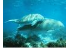
The dugong at sea