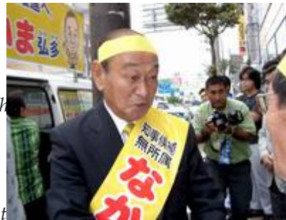
Nakaima Hirokazu on the campaign trail

For the next four years, many expect Okinawa's new governor, Nakaima, the former chairman of the Okinawa Electric Power Company, to follow many Japanese government's policies, notably the controversial plan to replace the US Marine Air Station at Futenma with a new US base at Henoko, Nago city, in the north of the island, in waters still relatively unspoiled which also constitute crucial habitat for the endangered dugong species.