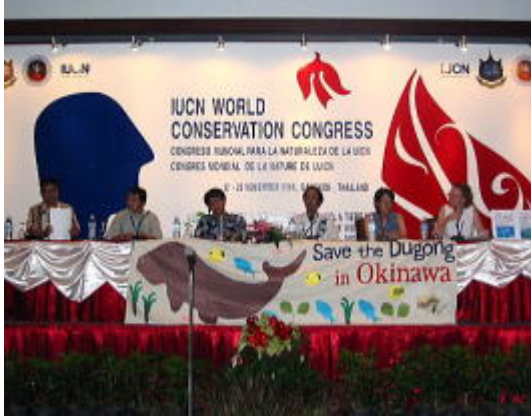
IUCN World Conservation Conference

Despite international pressure, the US government and military continue to refuse to recognize and take responsibility for their roles in the construction plan. Their refusal underlines the gravity of possible environmental destruction posed by construction of the base, thereby drawing further international attention to the plan. The Japanese government's unwillingness to request US government and military participation in the EIA further underlines potential problems associated with the construction plan.