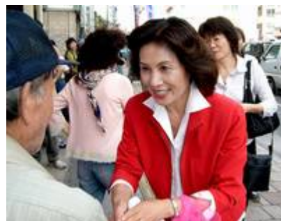
Candidate Itokazu Keiko