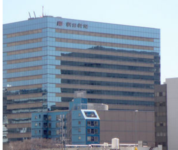
Asahi Shinbun headquarters in Tokyo

In the last week of January and the first weeks of February 2005, the words which leapt out at commuters' eyes from the advertisements were "lies", "witch hunt", "political pressure" and everywhere, the names of two of Japan's largest and most influential media institutions: the national broadcasting company NHK and the daily newspaper Asahi . The two organizations were embroiled in an intense battle over problem of media ethics and freedom, and their rival media organizations were observing the struggle with considerable glee.