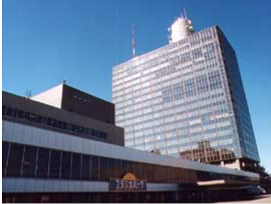
Tokyo headquarters of NHK

In the last week of January and the first weeks of February 2005, the words which leapt out at commuters' eyes from the advertisements were "lies", "witch hunt", "political pressure" and everywhere, the names of two of Japan's largest and most influential media institutions: the national broadcasting company NHK and the daily newspaper Asahi . The two organizations were embroiled in an intense battle over problem of media ethics and freedom, and their rival media organizations were observing the struggle with considerable glee.