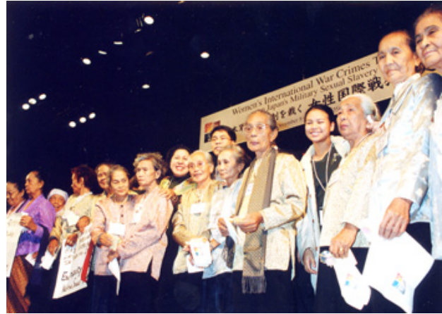
Former "comfort women" at the Tribunal

more formal national or international judicial forums. [2]