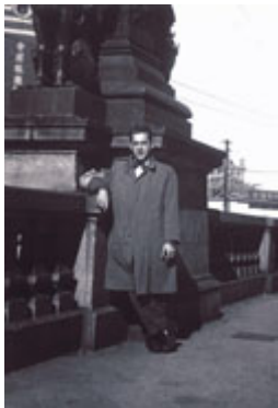
Donald Richie at Nihonbashi in 1947.

He saw Ginza when it was a blackened plain but for the bombed-out Mitsukoshi department store, the Hattori Building and a handful of other structures left standing. He observed the city as it was rebuilt, and its people. He observed, and then he wrote.