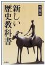
The New History Textbook

chaos in their wake. He claimed that the NM—that is, the event defined as the killing of 200,000- 300,000 civilians—was a fabrication and lashed out at school textbooks that provided such baseless casualty estimates. To him, Japan was engaging in a battle, in which killings of the enemy were justified, and slaughtering prisoners of war was also acceptable as keeping them alive could have endangered lives of the Japanese troops. Therefore, in contrast to the conclusions drawn by many historians, including Japanese historians, Fujioka concluded Japanese troops had committed no “massacre.” In response to what Fujioka deemed the masochistic message of the educational mainstream, the Japanese Society for Textbook Reform proceeded to author their own alternative text, titled New History Textbook ( Atarashii rekishi kyokasho ). While the authors were required to include a brief statement regarding the Japanese killing of civilians in Nanjing in order to secure government approval of their textbook, they tried to offset this compromise by stressing that the dispute over the Nanjing incident is ongoing and that various views exist on the subject. [6]