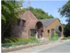
Okunoshima Poison Gas Museum, site of poison gas production during the Pacific War

addition, a number of “mobile peace museums” — that is, special exhibitions that underscore Japanese wartime atrocities—traveled across Japan and attracted tens of thousands of visitors.