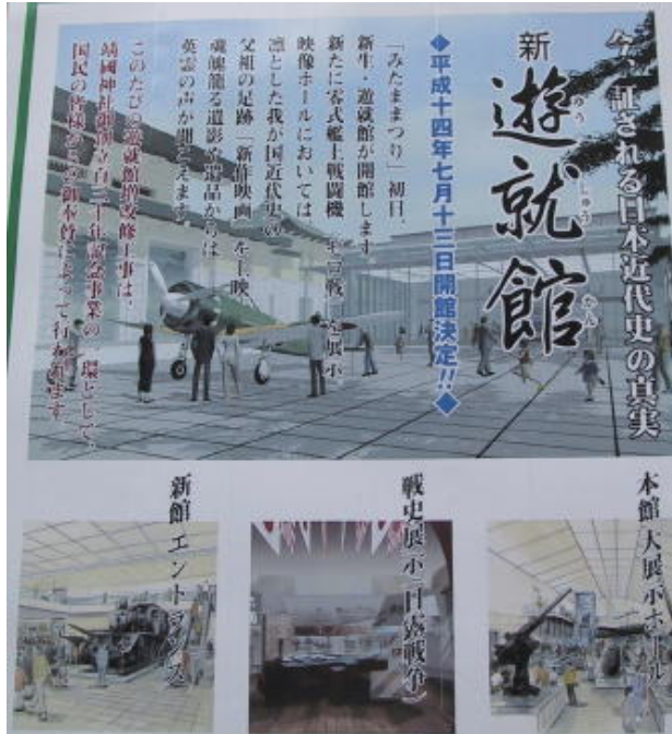
Yushukan war history exhibits at Yasukuni Shrine

While most revisionist accounts are available only in Japanese, some have also appeared in English since the 1990s. As the history and memory of the NM became internationalized, the Japanese revisionists have attempted to convince the world that what is known as the NM has been falsified. The spirit of these revisionist versions has much in common with some equally emotional, nationalistic, and ethnocentric statements about Nanjing that have emanated from China and the United States. Indeed, each has fed off the others. In China, many accounts and museum exhibits dealing with Nanjing have fostered a self-congratulatory nationalism, calculated to strengthen loyalty to the government while paying scant attention to the facts, as opposed to reiterating an iconic position