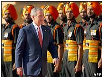
U.S. President George Bush in India in March.

At issue is a controversial nuclear cooperation deal signed between the US and India in March during President Bush’s visit to Delhi. Japan has yet to make clear its stance on the deal. Abe told the Indian premier that Japan is still considering its position on it.