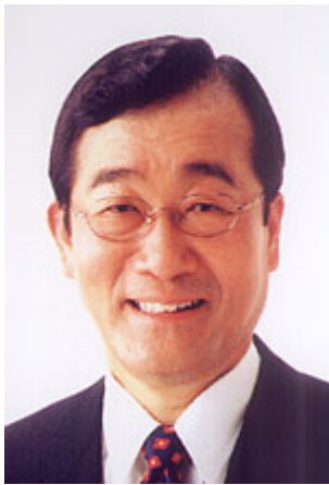
Japanese minister of agriculture Matsuoka Toshikatsu

Abe's seriousness about agricultural reform has been called in question. When inaugurating his cabinet in late September, Abe appointed Matsuoka Toshikatsu, a leader of the LDP lawmakers with close ties to the farm industry and most vocal opponent of market liberalization as minister of agriculture. Nevertheless, this month the cabinet gave the green light to entering full-fledged negotiations with Australia.