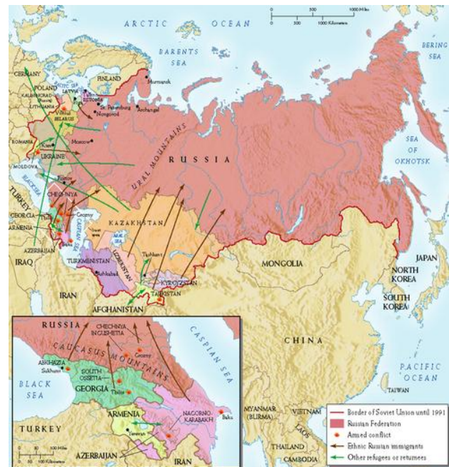
After the Soviet Union

by 80 percent. Most Russians were thrown into poverty. Death rates soared and the population shrank. And in August 1998, the financial system imploded.