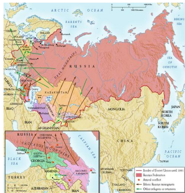
After the Soviet Union

by 80 percent. Most Russians were thrown into poverty. Death rates soared and the population shrank. And in August 1998, the financial system imploded.