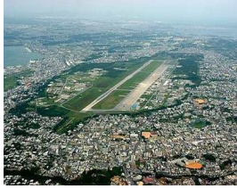
Futenma and environs