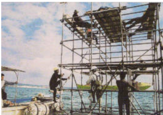
Henoko protesters occupy a platform

In October 2005, faced with the continuing opposition blockade at Henoko, Prime Minister Koizumi acknowledged that the government had been “unable to implement the (initial) relocation (plan) because of a lot of opposition.” [5] The Henoko offshore plan, like the heliport before it, was dropped. It was an admission of defeat by the state, and a tribute to the determination and persistence of the local coalition. It deserves to be recorded as one of the remarkable events in recent Japanese history: in a decade-long contest, Okinawa’s “Asterix” and “Obelisk” had defeated the nation state.