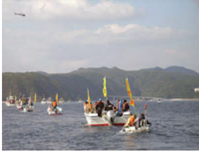
Henoko protest boats

In October 2005, faced with the continuing opposition blockade at Henoko, Prime Minister Koizumi acknowledged that the government had been “unable to implement the (initial) relocation (plan) because of a lot of opposition.” [5] The Henoko offshore plan, like the heliport before it, was dropped. It was an admission of defeat by the state, and a tribute to the determination and persistence of the local coalition. It deserves to be recorded as one of the remarkable events in recent Japanese history: in a decade-long contest, Okinawa’s “Asterix” and “Obelisk” had defeated the nation state.