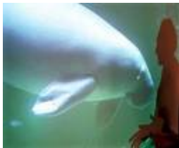
No base henoko

reveal what was going on were savagely prosecuted. [7] In similar vein, once again the Japanese government now promises to pay huge sums for the Futenma “reversion.” In the 2006 version, the replacement facility would comprise a large new base complex, to be built at Japanese expense at Camp Schwab, an existing US facility on Cape Henoko in close proximity to the abandoned offshore site. It would include a “V”-shaped runway of 1,800 meters, partly on land reclaimed from Oura Bay and partly on the reef, plus a pier and storage facilities where US nuclear aircraft carriers could be comfortably accommodated. [8] The heliport of 1996 had thus become a vast air and marine, military complex, with its own port and two runways instead of one.