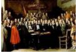
Signing of the Treaty of Westphalia

English nation, and expect impunity for so doing...”