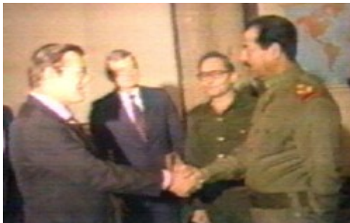
Saddam Hussain and Donald Rumsfeld in 1983

This confession was reported to the prosecutor and to the judges and it influenced their minds: it helped to convince Cooke, for instance, that “the King must die and monarchy with him.” Charles Stuart had no remorse, so he deserved to die. This was Cromwell’s fatal mistake: the King’s execution made him a martyr, and paved the way in public sentiment for the restoration of the monarchy eleven years later. (It is a mistake about to be repeated: the execution of Saddam Hussein will most likely tip Iraq into full-blooded civil war.)