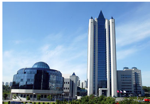
Gazprom's Moscow Office

In 2001, as it became clear in Moscow that Washington would find a way to bring the Baltic republics into NATO, Putin backed the development of a major new oil port on the Russian coast of the Baltic Sea in Primorsk at a cost of $2.2 billion. This project, known as the Baltic Pipeline System (BPS), greatly lessens export dependency on Latvia, Lithuania and Poland. The Baltic is Russia's main oil-export