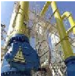
Sakhalin Natural Gas

Late last month a seemingly minor dispute exploded and resulted in the revocation of the environmental permit for Royal Dutch Shell's Sakhalin II liquefied-natural-gas project, which had been due to deliver LNG to Japan, South Korea and other customers by 2008. Shell is the lead energy partner in an Anglo-Japanese oil and gas development project on Sakhalin, a vast Russian island north of Hokkaido, Japan.