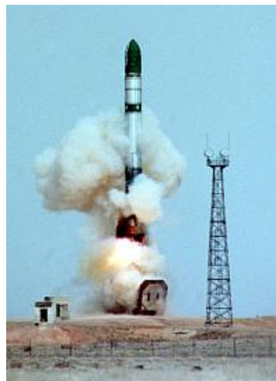
Russian SS-18 missile

Moscow has not been entirely passive in the face of this growing reality. In his May 2003 State of the Nation address, Vladimir Putin spoke of strengthening and modernizing Russia's nuclear deterrent by creating new types of weapons, including some for Russia's strategic forces, which will "ensure the defense capability of Russia and its allies in the long term". Russia stopped withdrawing and destroying its SS-18 MIRVed (multiple independent re-entry vehicle) missiles once the Bush administration unilaterally declared an end to the Anti-Ballistic Missile treaty, and its de facto annulling of START II (Strategic Arms Reduction Treaty).