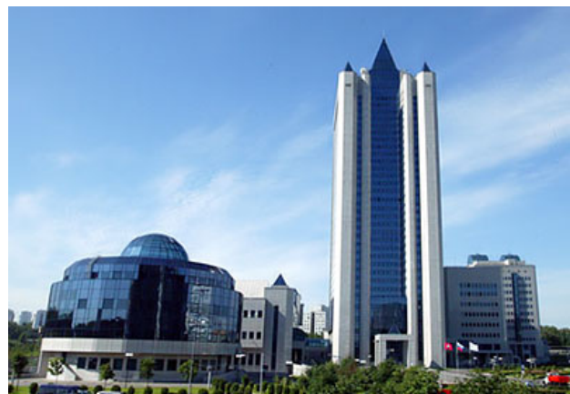
Gazprom's Moscow Office

Also in March, former German chancellor Gerhard Schroeder was named chairman of a Russian-German consortium building a natural-gas pipeline going some 1,200km under the Baltic Sea. Majority shareholder in this North European Gas Pipeline (NEGP) project, with 51%, is the Russian state-controlled Gazprom, the world's largest natural-gas company. The German companies BASF and E.ON each hold 24.5%. The project, estimated to cost 4.7 billion euros ($5.8 billion), was started in late 2005 and will connect the gas terminal at the Russian port city of Vyborg on the Baltic near St Petersburg with the Baltic city of Greifswald in eastern Germany.