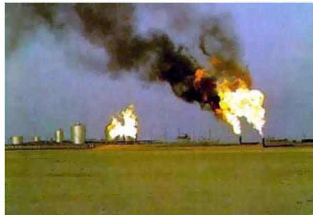
Russian Natural gas fields to supply Turkey

Last November, Russia's Gazprom completed the final stage of its 1,213km, $3.2 billion Blue Stream gas pipeline. The project brings gas from its fields in Krasnodar, then by underwater pipelines across the Black Sea to the Durusu Terminal near Samsun on the Turkish Black Sea coast. From there the pipeline supplies Russian gas to Ankara. When it reaches full capacity in 2010, it will carry an estimated 16 billion cubic meters gas a year.