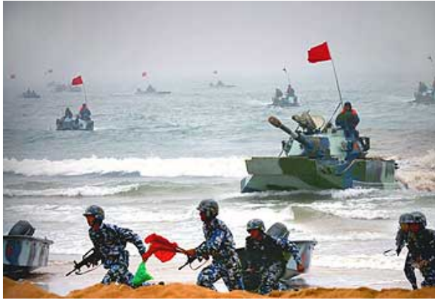
Chinese tanks and marines in amphibious exercise with Russian troops

They realize more than one can play the game. In May, Russian Defense Minister Sergei Ivanov hosted the chief of staff of the People's Liberation Army and discussed increased cooperation in the context of Russia's and China's leading role in the Shanghai Cooperation Organization (SCO). Russia will increase deliveries of selected military technology to China as well as train Chinese military at the institutes of the Russian Ministry of Defense.