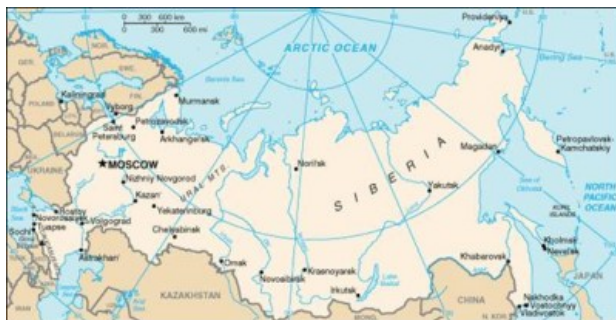
Map of Eurasia and the Arctic

The giant Shtokman gas deposit in the Russian sector of the Barents Sea, north of Murmansk, will ultimately also be a part of the gas supply of the NEGP. When completed in two parallel pipelines, NEGP will supply Germany up to 55 billion cubic meters more a year of Russian gas.