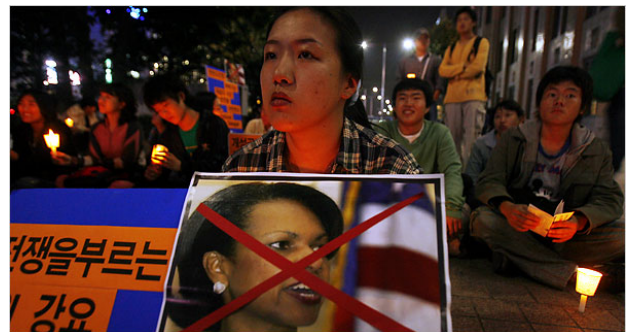
South Korean youth demonstrate against Condoleezza Rice's message

liberal democracy is now being replaced by differences of tradition, values and social realities among nations. The search for a “post-division” identity in contemporary South Korea plays an important part in the shift away from confrontation with North Korea toward reconciling the bonds of community that was torn apart by the Cold War. Moving beyond the Cold War narrative of the Korean War, South Koreans are attempting to re-write this history by re-affirming an old mythos of national victimization and struggle that seeks to bind North and South Korea as one nation against powerful foreign foes (Japan and the United States) that would (albeit inadvertently) destroy it. It is this reasoning that has led the Roh administration to vigorously oppose U.S. pressure to participate in the Proliferation Security Initiative, claiming that it could lead South Korea to unwanted armed conflict with Pyongyang .