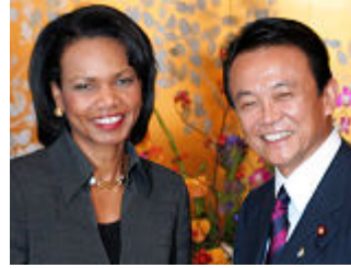
Rice in Japan with Foreign Minister Aso Taro.

Thus, via this last factor, the United States has continuing and unique ability to influence Pyongyang’s decision on when and if the DPRK conducts more nuclear tests.