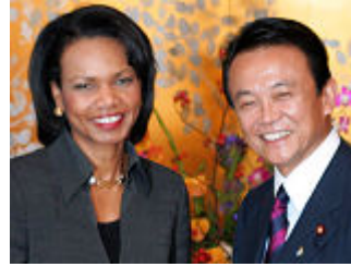
Rice in Japan with Foreign Minister Aso Taro.

Thus, via this last factor, the United States has continuing and unique ability to influence Pyongyang’s decision on when and if the DPRK conducts more nuclear tests.