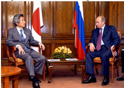
Koizumi and Putin meet in Chile in November 2004.

At first, Putin thought that the gathering could serve as a ceremony of reconciliation not only with Germany, but also with Japan, another defeated nation in World War II. Putin's Russia seeks to fund its national development by selling oil or natural gas to the countries of the West or Asia, so reconciliation with Germany was desirable in terms of expanding sales routes for energy. Around the time that Putin invited Prime Minister Koizumi Junichiro to the commemorative gathering in Moscow, he also tried to restart talks on the Northern Territories issue ( http://www.tanakanews.com/g0112russia.htm ).