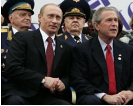
Putin and Bush in Moscow in May 2005

At first, Putin thought that the gathering could serve as a ceremony of reconciliation not only with Germany, but also with Japan, another defeated nation in World War II. Putin's Russia seeks to fund its national development by selling oil or natural gas to the countries of the West or Asia, so reconciliation with Germany was desirable in terms of expanding sales routes for energy. Around the time that Putin invited Prime Minister Koizumi Junichiro to the commemorative gathering in Moscow, he also tried to restart talks on the Northern Territories issue ( http://www.tanakanews.com/g0112russia.htm ).