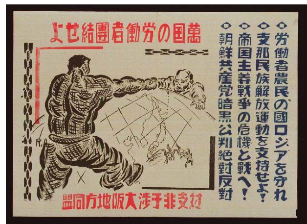
Call to action

exuberant era were producing a wealth of posters, paintings, poems, plays, and prose with antimilitarist, anti-imperialist, and anti-capitalist themes. Representative of antiwar literature of the period was Kitagawa Fuyuhiko's acclaimed 1929 poetry collection Senso (War). [1]