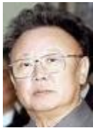
North Korean Leader Kim Jong Il

Pyongyang's nuclear challenge undermine American nuclear hegemony, put in doubt the U.S. nuclear guarantees to the allied states against nuclear threats from nuclear powers, mock Washington's promise to halt the spread of nuclear weapons to local enemies, further damage the nuclear nonproliferation regime, and weaken U.S. leadership in Northeast Asia. But, on October 9, 2006, the DPRK called the U.S. bluff.(4)