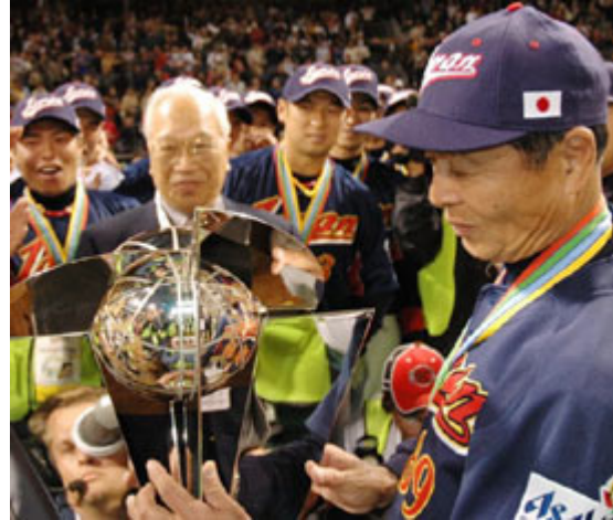
Sadaharu Oh at WBC 2006

Indeed, the smooth, much-praised performance of Team Japan in WBC 2006, an event that was widely watched in Japan, caused many Japanese baseball experts to conclude that after all, their way was best. The manager of Team Japan was none other than the aforementioned Oh, a man whose name was synonymous with backbreaking workouts during a storied career in which he hit 868 home runs.