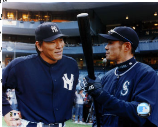
Hideki Matsui and Ichiro Suzuki

The success of players like Ichiro Suzuki and Hideki Matsui in the United States has once again demonstrated the power of sport in crossing national borders. With their stirring performances on America’s baseball diamonds, these imported players have helped to create vast new markets for Major League baseball in Japan, while teaching Americans that there is a new and very different way to approach their own national pastime. More importantly, the accomplishments of these athletes have served to influence the way many Americans and Japanese look at each other, and raised anew questions about the role of culture in sport.