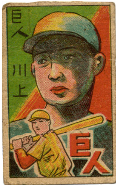
Tetsuharu Kawakami baseball card

Self-sacrifice, one might say, is a rather more complex disposition than that of a ‘cardboard samurai’—and Kawakami was among the league leaders in rather more like definitions of effort familiar to athletes sacrifice bunts, despite having the most powerful in the United States and elsewhere. [20] 1-2 punch in Japanese baseball history in Oh and legendary third baseman Shigeo Nagashima. This strategy of sacrifice bunting at the earliest opportunity all too often left first base open when Oh came to bat, resulting in an inevitable walk, and literally taking the bat out of his star slugger’s hands. This practice, not uncommon in Japan but generally considered counterproductive in MLB by both managers and players, may well have prevented the great Oh from reaching the lofty 1,000 career home runs mark.