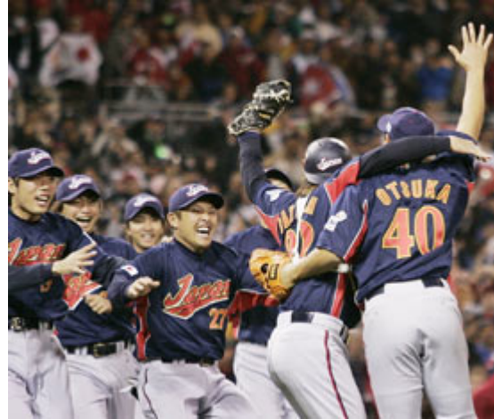
The Japanese team after winning WBC 2006

Ichiro has put together an unprecedented string of 200-hit seasons, breaking George Sisler's 84-year-old single-season-hits record, while spurring an influx of tourists from Japan that has brought millions of dollars into the Northwest area economy. Matsui has become a popular, reliable fixture in the New York Yankees outfield, while Tadahito Iguchi played such an important role on the 2005 World Champion Chicago White Sox squad that his manager Ozzie Guillen called him the real MVP of the team. The subsequent emergence of an enormous new market for Mariner, Yankee and White Sox telecasts in Japan has also helped. At the end of the 2003 season, Major League Baseball (MLB) signed a record $275-million TV contract with the giant Japanese advertising firm Dentsu, and then sent the Yankees and the Tampa Devil Rays to play an opening-day game in Tokyo in 2004. Moreover, the MLB and the Major League Baseball Players Association (MLBPA) enthusiastically promoted the establishment of the World Baseball Classic (WBC), a quadrennial tournament that debuted in March 2006, featuring national teams from 16 countries—with American organizers going to extraordinary lengths to coax an initially reluctant Japan to join in. All in all, that represents quite a transformation.