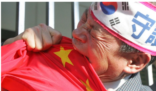
South Korean protester at the Chinese embassy in Seoul, 7 September 2006

Needless to say, few people in Korea accepted that these new actions of Chinese researchers were merely the result of academic curiosity, and general outrage followed. Noisy demonstrations took place in front of the Chinese embassy. Some ultra-nationalists even bit, chewed and then burned a Chinese flag in front of the cameras. President Roh decided to raise the issue during the recent summit with the Chinese chief executive, and Korean newspapers of all persuasions ran articles very critical of the Chinese positions. China’s actions were widely seen as a unilateral breach of the 2004 agreement.