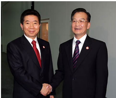
Roh Moo-hyun and Wen Jiabao in Helsinki

In Helsinki on 10 September 2006, South Korean President Roh Moo-hyun met Chinese Premier Wen Jiabao. Since the summit took place when the two leaders were attending the ASEM forum, they did not have much time to talk, so they had to concentrate on the most important issues in bilateral relations.