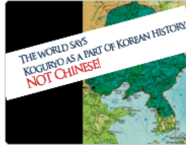
Korean response to China's world heritage proposal