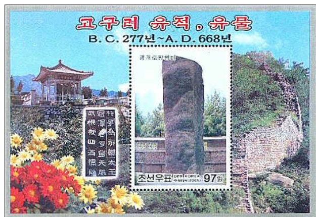
Koguryo tombs. DPRK stamp