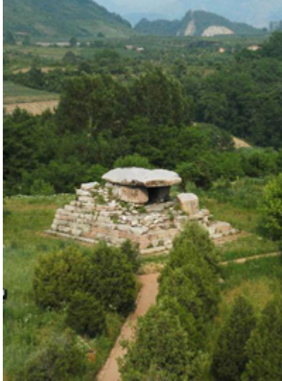
Photograph in Chinese claim to Koguryo World Heritage site.