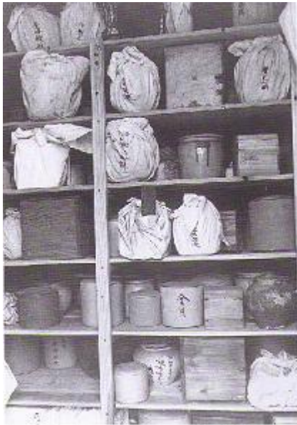
Tsubo bearing Korean names at Saishoji Temple in Chikuho, 1970s

outside Korea. Aso's assertion about the name system outraged the South Korean public, prompting a major television station to dispatch a film crew to Chikuho to report on Korean forced labor at Aso Mining.