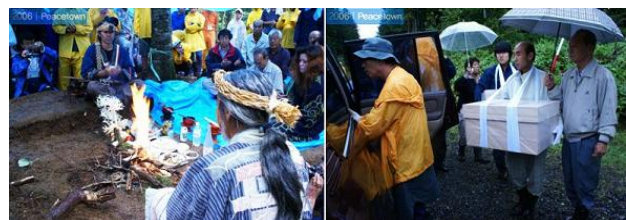
Ainu memorial rites for Korean forced laborers in Hokkaido and remains headed home to Korea, August 2006

war, as corporations withheld workers’ mandatory contributions to the national pension fund. The Unpaid Financial Deposits Report details the wages and related allowances owed to workers but never paid out by corporations; it was compiled after the Welfare Ministry instructed companies to deposit these monies into the national treasury in 1946. In fact, the Bank of Japan today possesses 215,147,000 yen in unpaid wages for Korean forced laborers, with the deposits (consisting of 167,791,400 yen in cash and 47,355,600 yen in marketable securities) now worth perhaps $2 billion.[11] Surprisingly, the Truth Commission is not currently calling for release of the unpaid wage deposits. Rather, the Seoul government has proposed paying equivalent compensation from its own state coffers in documented individual cases. Tokyo has reportedly requested South Korean forbearance regarding the deposits until diplomatic relations can be restored with North Korea. Roughly ten percent of conscripts came from the north and their compensation claims are still open.