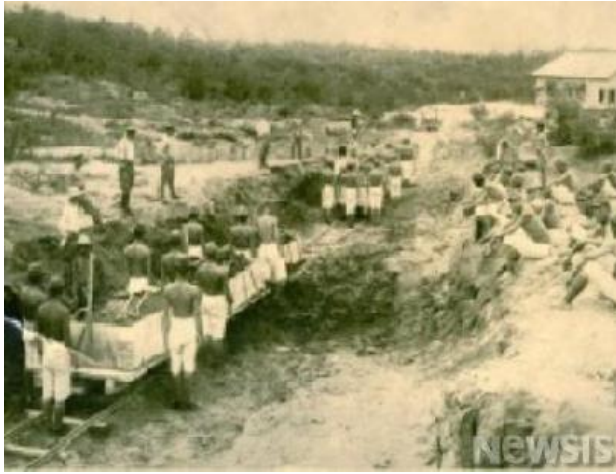
Korean military conscripts on Pacific island circa 1943

hardships borne by military personnel above those of civilians.[56]