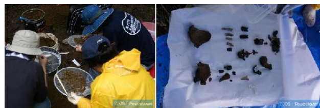
Asian students sift soil for Korean bones in Hokkaido, August 2006

Because Japanese society is sharply divided about the nature of Korean forced labor and labels for describing it, and because there is no strong consensus regarding Japan’s colonial rule of Korea from 1910 to 1945, Japanese remain far from agreement with Koreans about how to come to terms with this major aspect of their nations’ shared past. However, doing nothing about the legacy of forced labor, the prevailing approach for the past six decades, is no longer an option. The singularly complex and dynamic Korean forced labor reparations movement is being empowered by the direct involvement of the South Korean state and the activities of a transnational civil society that are without parallel in Asia or perhaps anywhere.