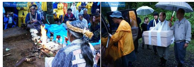
Ainu memorial rites for Korean forced laborers in Hokkaido and remains headed home to Korea, August 2006

war, as corporations withheld workers’ mandatory contributions to the national pension fund. The Unpaid Financial Deposits Report details the wages and related allowances owed to workers but never paid out by corporations; it was compiled after the Welfare Ministry instructed companies to deposit these monies into the national treasury in 1946. In fact, the Bank of Japan today possesses 215,147,000 yen in unpaid wages for Korean forced laborers, with the deposits (consisting of 167,791,400 yen in cash and 47,355,600 yen in marketable securities) now worth perhaps $2 billion.[11] Surprisingly, the Truth Commission is not currently calling for release of the unpaid wage deposits. Rather, the Seoul government has proposed paying equivalent compensation from its own state coffers in documented individual cases. Tokyo has reportedly requested South Korean forbearance regarding the deposits until diplomatic relations can be restored with North Korea. Roughly ten percent of conscripts came from the north and their compensation claims are still open.