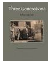
Yom Sang-seop's Three Generations

bluntness that seems awkward when set against, for instance, the Japanese aesthetic of indirection. The structure of the novel is uneven, the prose unremarkable. Nevertheless, in its way, Three Generations successfully portrays a society throttled by the "modernization" that Japan inflicted upon the peninsula. This delayed development, as much as the more violent policies of the era, constituted the tragedy of the colonial experience.