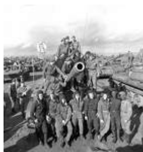
The Inchon Landing

Sinchon worked clandestinely with an anti-Communist youth corps from the South to seize the county administration from the Communists. These men of God show no mercy. "In the beginning, there is no rape," one ghost relates. "Far from it. Many times, after a kill, the young men stand together in a circle to pray together." Later, as the body count mounts, there is time for neither prayer nor proscriptions against rape. When the Communist Party cadres regroup and regain control, their vengeance is equally unsparring. The wounded are shot on the spot. Prisoners are lined up against the wall and executed. Young men are dragged into military service against their will and then, when the fortunes of war shift and they fall into "enemy" hands, they are killed as surely as the true believers.