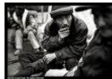
Japan's new homeless

between 2-2.5% during the 1980s rose to 5.5% by the end of 2001; the suicide rate, traditionally higher in Japan than in Europe or North America, increased from 16.4/100,000 in 1990 to 25.5/100,000 by 2003 (Statistics Bureau 2005). And even greater changes are about to unfold: in 2007 the first large cohort of elderly baby boomers will launch the country's mass retirement wave (typically at age 60); at the same time, increasing numbers of young people (already more than one million) have opted out of the labor market. This NEET generation (not in employment, education or training), which prefers hanging out in strange clothes and hairdos, can be seen as a sign both of Japan's national decline and its personal affluence.