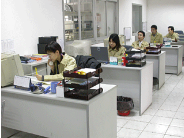
China's new industries

This economic surge has attracted a great deal of attention, much of it awed by the country's achievements (Démurger 2000; Fishman 2005; Shenkar 2005; Sull and Wang 2005). Continuation of China's high (though gradually moderating) GDP growth rate would make the country the world's largest economy sometime between 2025 and 2040. Wilson and Purushothaman (2003) project China's GDP (in exchange-rated terms) to surpass that of Germany by 2007 and that of Japan in 2016 and reaching the US level by 2041. But in per capita terms China would still be far behind the United States. By 2040 the two countries will have, respectively, about 1,430 and 380 million people, so identical GDPs would leave China's per capita level at roughly a fourth of the US rate. A projected per capita GDP rate of about $19,000 (in 2003 monies) a year would make China as rich as today's Greece.