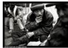
Japan's new homeless

between 2-2.5% during the 1980s rose to 5.5% by the end of 2001; the suicide rate, traditionally higher in Japan than in Europe or North America, increased from 16.4/100,000 in 1990 to 25.5/100,000 by 2003 (Statistics Bureau 2005). And even greater changes are about to unfold: in 2007 the first large cohort of elderly baby boomers will launch the country's mass retirement wave (typically at age 60); at the same time, increasing numbers of young people (already more than one million) have opted out of the labor market. This NEET generation (not in employment, education or training), which prefers hanging out in strange clothes and hairdos, can be seen as a sign both of Japan's national decline and its personal affluence.