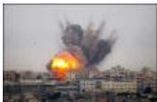
Israeli missiles target Beirut

This is the message of the conflicts in Gaza, the West Bank, and Lebanon—to use only the examples in today’s papers. Walls are no longer protection for the Israelis—one shoots over them. Their much-vaunted Merkava tanks have proven highly vulnerable to new weapons that are becoming more and more common and are soon likely to be in Palestinian hands as well. At least 20 of the tanks were seriously damaged or destroyed.