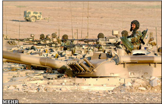
Iranian Missile Exercise

What is now occurring in the Middle East reveals lessons just as relevant in the future to festering problems in East Asia, Latin America, Africa and elsewhere. Access to nuclear weapons, cheap missiles of greater portability and accuracy, and the inherent limits of all antimissile systems, will set the context for whatever crises arise in North Korea, Iran, Taiwan...or Venezuela. Trends which increase the limits of technology in warfare are not only applicable to relations between nations but also to groups within them—ranging from small conspiratorial entities up the scale of size to large guerilla movements. The events in the Middle East have proven that warfare has changed dramatically everywhere, and American hegemony can now be successfully challenged throughout the globe.