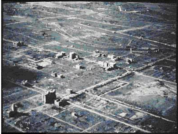
1. Hiroshima following the atomic bombing

These formal statements clearly reflect the Japanese government's assessment, but they also articulate widely held popular attitudes concerning Japan's war responsibility. In other words, in the absence of explanation of any kind, the viewer is left to conclude that Japan simply, inexplicably, "walked the path of war" and the "real" war started with the attack on Pearl Harbor on December 8, 1941. That "real" war, in other words, did not begin on September 18, 1931, the day that the Japanese Army detonated an explosion on the South Manchurian railway, providing the pretext for the seizure of Manchuria and the establishment of Manchukuo under Japanese aegis. Nor did it begin on July 7, 1937, when the Marco Polo Bridge Incident plunged Japan into full-scale war leading to the occupation of large areas of China. In the Memorial Hall's rendering, Japan's major enemies in the Asia-Pacific War were the U.S. and Great Britain, not China, still less the other Asian peoples that Japan conquered following