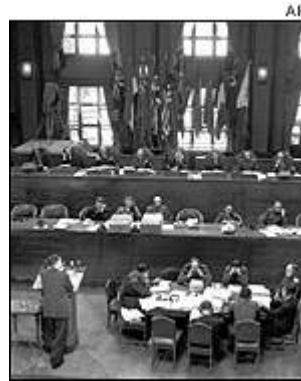
3. The Tokyo War Crimes Tribunal

On December 8, 1945, the same day that the newspaper series commenced, General MacArthur issued an order to set up the IPS (International Prosecution Section) for the IMTFE (International Military Tribunal for the Far East, popularly known as the Tokyo War Crimes Tribunal) and appointed an American lawyer, Joseph Keenan, as the chief prosecutor. A-class war crime suspects had already been arrested and the IMTFE was planned to open in May 1946. In short, one of the aims of the media exercises directed by CIE was to prepare the Japanese people to accept the legitimacy of the Tokyo War Crimes Tribunal on basis of the official American interpretation of the Asia-Pacific War.