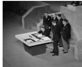
4. Prime Minister Yoshida Shigeru signing the San Francisco Peace Treaty

neither North Korea, fighting the U.S. in the Korean War, nor South Korea were invited to attend, on the dubious ground that Korea was not a state at the time of Japan’s surrender in 1945. India and Burma refused to participate in the conference, regarding it as a “rigged affair” so that only four Asian nations – the Philippines, Indonesia, Ceylon and Pakistan – attended the conference. Yet Indonesia never ratified the treaty, but signed a separate peace treaty with Japan in 1958. The Philippines only ratified the treaty after it came into effect. In this way, the “invisibility of Asia” was again conspicuous at the San Francisco Peace Treaty Conference.