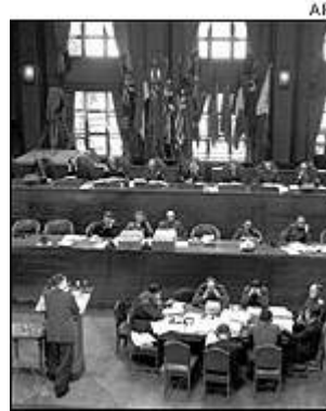
3. The Tokyo War Crimes Tribunal