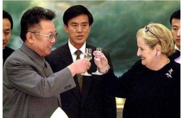
Secretary of State Madeleine Albright meets Kim Jong-il in Pyongyang

promises led to the collapse of the deal, despite last-minute efforts to revive it in the final months of the Clinton administration.