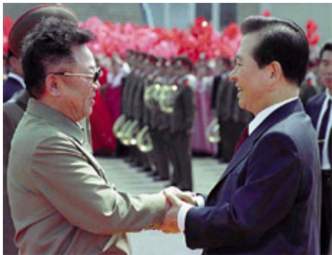
Kim Dae Jung and Kim Jong-il meet in Pyongyang in 2000

administration, and perhaps by China, prioritizes reduction in military tensions, provision of economic aid to North Korea, and encouragement of economic reform leading eventually toward economic, social, and eventually political integration of North and South. As envisaged in the North-South Agreement of 2000 between Kim Dae Jung and Kim Jong-il, this would take the form of steps toward a Korean confederation leading eventually toward reunification.