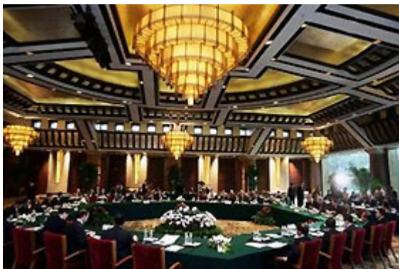
Diplomats attend the Six-Party Talks at the Diaoyutai Guest House in Beijing on September 19, 2005

The best, perhaps ultimately the only, prospect for moving forward on the diplomatic front lies with the Six-Party talks. The US proposal for Five-Party talks, in the absence of North Korea, can only result in further isolating of North Korea.