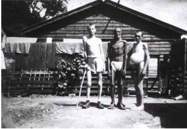
Fukuoka POW Camp 3

Japan Focus recently publicized the fact that 300 Allied prisoners of war performed forced labor at Fukuoka POW Camp 26 ( http://www.japanfocus.org/products/details/1627 ), better known as Aso Mining's Yoshikuma coal pit. A stream of English-language media accounts of the Aso-POW connection followed in Japan, Australia, Canada, France, South Korea, Taiwan, the United States, the United Kingdom—and even Qatar. No Japanese-language media, however, have reported that Allied POWs toiled for the company headed during the 1970s by Aso Taro, even though the foreign minister is a candidate to succeed Koizumi Junichiro as prime minister in September. Aso has not yet replied to a written request for an apology and compensation sent to him in June by the daughter of an 87-year-old Australian man who worked without pay at the Aso Yoshikuma mine in 1945.