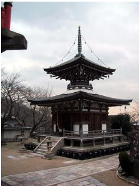
Juganji temple near Osaka

"His attendance has already been highly politicized by the media, and Aso apparently decided not to cause further turmoil by involving ambassadors," said a senior Foreign Ministry official who accompanied his boss on Monday.