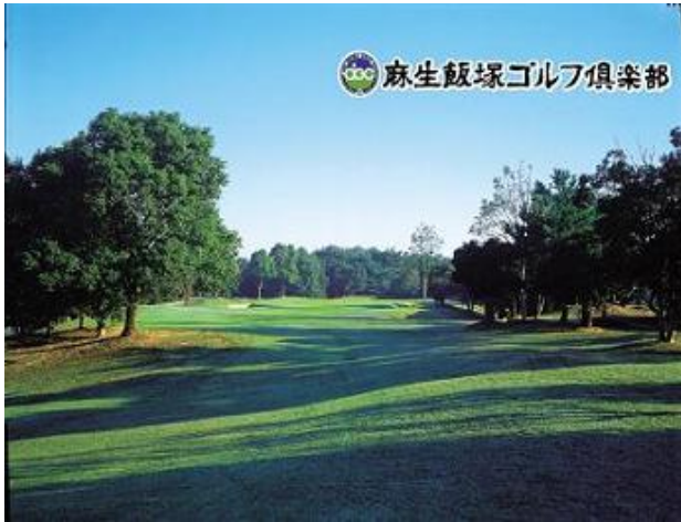
Aso Iizuka Golf Club, near the former Yoshikuma mine site

About 20 priests, 60 local residents and a nephew of a deceased U.S. POW whose ashes were once held at the temple also attended the service. Foreign embassy officials stayed away as requested.