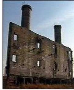
Remains of one of Unit 731's germ factories in Manchuria serve as a reminder of the atrocities that took place during Japan's occupation of China during World War II

During the 1981 burst of publicity, Justice B.V.A. Roling, a Dutchman and the only surviving judge from the International Military Tribunal for the Far East in Tokyo, Asia's Nuremberg, complained that no word about biological warfare had been offered in evidence. He wrote: "It is a bitter experience for me to be informed now that centrally ordered Japanese war criminality of the most disgusting kind was kept secret from the court by the U.S. government."