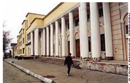
Site of the Khabarovsk Trial