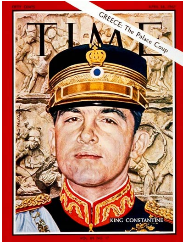
King Constantine, 1967

The state awarded the ex-king 4 million Euros in compensation for his 550 million Euros in confiscated assets. Constantine still refuses to recognize the Greek republic, is banned from owning a passport and has become a figure of ridicule. Many public figures openly mock him, calling him the 'half-wit king' and "o Teos" ("the former").