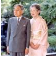
Emperor and Empress: Formal portrait

But my colleague's point was important. The presence of somebody from outside the system threatens to disrupt the carefully rehearsed dance between the Imperial Palace and the press that covers it. The problem was the IHA had no leverage over people like me: a local journalist could be kicked out of the press club or fired for asking an unscripted question in front of the cameras.