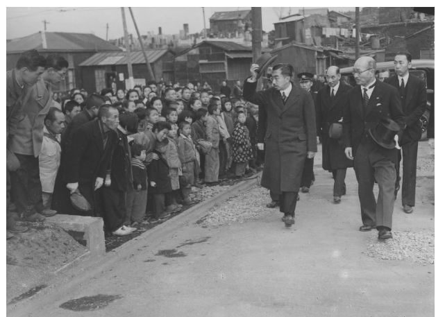
Emperor Hirohito going to the people, 1946