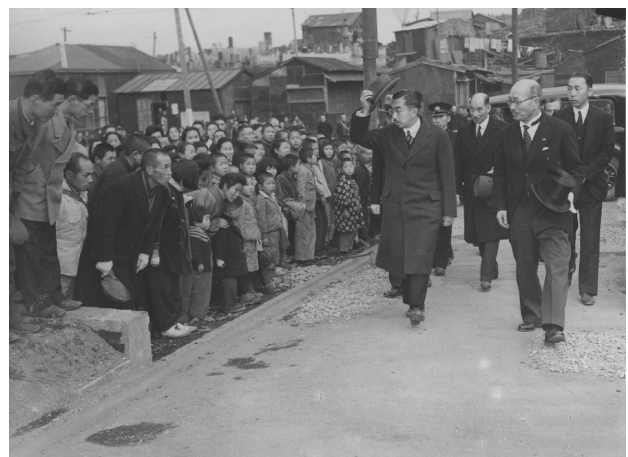
Emperor Hirohito going to the people, 1946