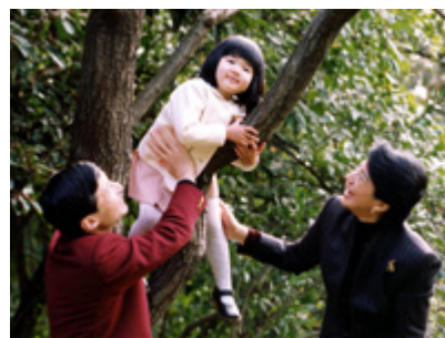
Crown Prince Noriito, Princess Masako, and daughter Aiko