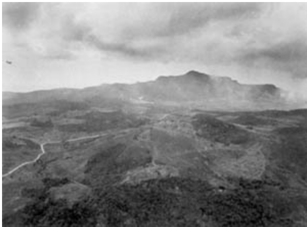
Aerial view of Saipan, July 1944.