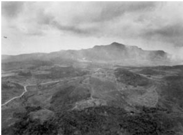
Aerial view of Saipan, July 1944.