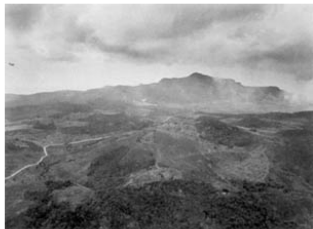
Aerial view of Saipan, July 1944.