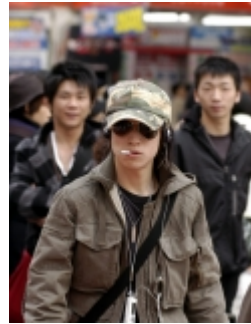
The freeter generation

professionals in the worlds of music or the theatre and the like. At first the problem of "freeters" was seen as a problem concerning a shift in young people's attitude to work.