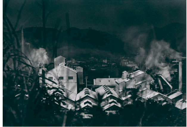
The Chisso Minamata plant

Even the chairman of Chisso was present. For the past half-century, Japan's, and the world's, environmentalists have cursed the name of Chisso. This is the company that caused Minamata Disease by dumping organic mercury into the bay, and then denying responsibility when the first victims appeared. This is the company that twisted the arms of the first impoverished victims back in 1959, forcing them to sign an agreement saying they would not sue Chisso even if in the future the company was found to be the cause. In return, they got payments of between 30,000 and 300,000 yen, minuscule sums, yet more money than most had ever seen.