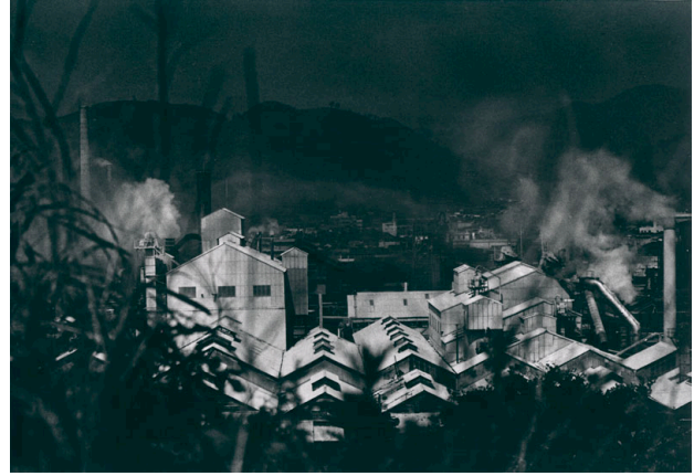
The Chisso Minamata plant

Even the chairman of Chisso was present. For the past half-century, Japan's, and the world's, environmentalists have cursed the name of Chisso. This is the company that caused Minamata Disease by dumping organic mercury into the bay, and then denying responsibility when the first victims appeared. This is the company that twisted the arms of the first impoverished victims back in 1959, forcing them to sign an agreement saying they would not sue Chisso even if in the future the company was found to be the cause. In return, they got payments of between 30,000 and 300,000 yen, minuscule sums, yet more money than most had ever seen.