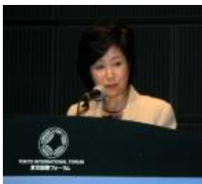
Environment Minister Koike Yuriko

whose agency has consistently fought against further compensation or efforts to certify all those who are suffering from the medically-accepted definition of Minamata Disease but cannot get the government to recognize their plight for political reasons. The city had originally wanted Prime Minister Koizumi Junichiro to put in an appearance as well, but he said no.