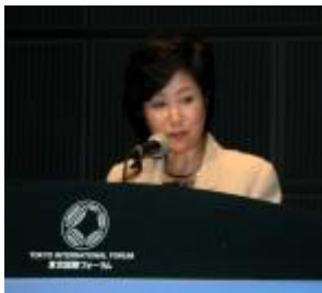
Environment Minister Koike Yuriko

whose agency has consistently fought against further compensation or efforts to certify all those who are suffering from the medically-accepted definition of Minamata Disease but cannot get the government to recognize their plight for political reasons. The city had originally wanted Prime Minister Koizumi Junichiro to put in an appearance as well, but he said no.