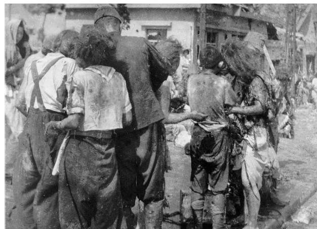
Atomic Bomb survivors at Miyuki Bridge, Hiroshima, two kilometers from Ground Zero. August 6, 1945.

whose skin was burned in the pattern of cloth she was wearing when the bomb struck. [2] Gary Nash and Julie Jeffrey's The American People shows no actual human victims, but it presents an Osaka department store exhibit displaying a pictorial version of the victims in agonizing flight. In examining the texts, one is reminded of U.S. World War II regulations and subsequent wartime censorship most notable in the Afghan and Iraq Wars, which barred media publication of dead and mutilated bodies, whether of soldiers or civilians, U.S. or enemy. [3]