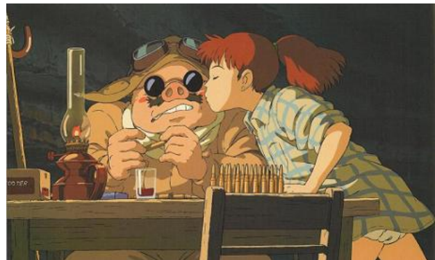
A scene from Porco Rosso

American distributor of Miyazaki’s films, will release a video version of “Porco,” whose title charter will be voiced by Michael Keaton. It will also make available an English version of “Nausicäa, with voices by Uma Thurman and Patrick Stewart. With these two releases, the entirety of Miyazaki’s eccentric output will be available in good English versions for the first time.