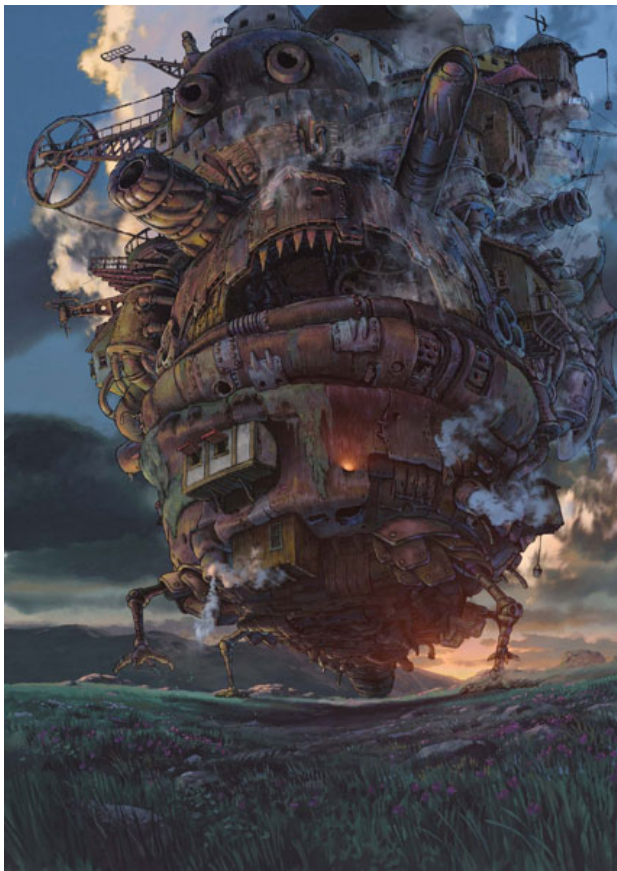
From Howl's Moving Castle

when you finish that room do you worry about the next. In the West, you start from the general and go to the specific. A Hitchcock movie might start off with a panorama of the city, and then the camera closes in on a street, and a house, and then the stairway inside. If you're a Japanese filmmaker, you might start with the railing on the stairway. When Miyazaki makes a film, he is thinking, like with this new one, O.K., first off, here are two very important points to settle: Does Sophie, the little girl in the movie, have braids or not? Are they long or short?"