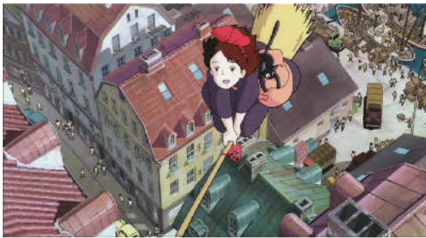
A scene from Kiki's Delivery Service

Miyazaki's producer and longtime collaborator. "When silents moved to talkies, Chaplin held out the longest," he told me. "When black-and-white went to color, Kurosawa held out the longest. Miyazaki feels he should be the one to hold out the longest when it comes to computer animation." Miyazaki lavishes particular attention on his backgrounds, which are full of painterly flourishes. I'd never really noticed the colors in an animated film until I noticed his. Skies and seas are saturated in strangely emotional blues; wet halos surround the red lantern and absinthe-green neon signs in "Spirited Away"; in "Kiki's Delivery Service," the young witch's dress isn't quite black—it's the smudged purple of the darkest plums.