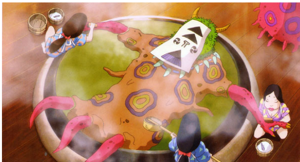
A scene from Spirited Away

gardens, lavishly packaged tiny melons), and where few places are untouched by commerce (there are vending machines on Mt. Fuji). “Spirited Away” contains a memorable scene in which a gloppy-looking creature—the spirit of a polluted river—comes to a bathhouse to be cleansed; a lot of dirty, foul-smelling labor is required. For this sequence, Miyazaki drew on his own memories of cleaning up a river—and pulling things like bicycles out of the muck.