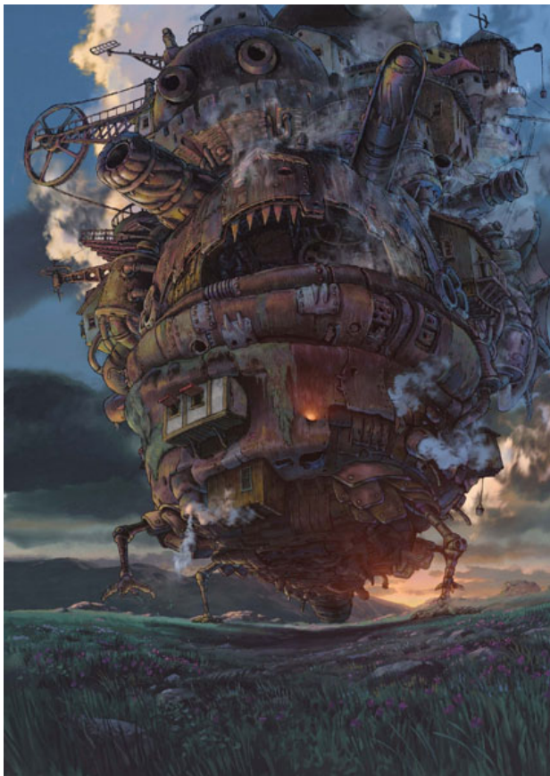
From Howl's Moving Castle

when you finish that room do you worry about the next. In the West, you start from the general and go to the specific. A Hitchcock movie might start off with a panorama of the city, and then the camera closes in on a street, and a house, and then the stairway inside. If you're a Japanese filmmaker, you might start with the railing on the stairway. When Miyazaki makes a film, he is thinking, like with this new one, O.K., first off, here are two very important points to settle: Does Sophie, the little girl in the movie, have braids or not? Are they long or short?"