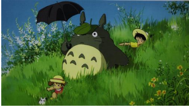
A scene from My Neighbor Totoro

The tone of the film is dreamy and playful—it has the sun-soaked colors and languid pace of a summer afternoon in the country—but the way it melds such elements with a subtle psychological treatment of the children’s anxiety over their mother makes it a radical film. When four-year-old Mei learns that her mother won’t be coming home for a visit as planned, her grief takes the form of a tantrum. She howls—her mouth a black cavern, her arms stiff. (In Disney movies, children weep decorously or break into poignant song.) Satsuki, panicked and struggling to be the mature sister, shouts at her not to be so “stupid”; Mei runs away to the hospital to find her mother. Both girls are ultimately rescued by the cat bus, which opens up a warm, golden, womb-like interior to them—an entrancing image of solace—and bounds across the countryside to return them to their father. Miyazaki is a master at conveying emotions as a child would experience them: obliquely, often physically, with a thread of magical thinking that promotes resilience.