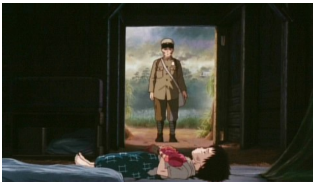
A scene from Grave of the Fireflies

Takahata and Miyazaki, who worked together so closely for years, have lately moved in different directions. Takahata is more interested in literary and film theory, more cerebral and less enamored of magic. His films are not for children, and “Grave of the Fireflies” could easily have been a live-action film. Takahata is sixty-nine, but he has a formidable head of dark hair and a handsome, unwrinkled face. “With Miyazaki, you have to totally believe in the world of the film,” Takahata told me. “He is demanding that the audience enter the world he has created completely. The audience is being asked to surrender.” He paused. “I want the audience to have a little distance. My relationship with him is limited now. We are friends but we don’t have a direct working relationship.”