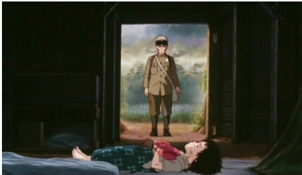
A scene from Grave of the Fireflies

Takahata and Miyazaki, who worked together so closely for years, have lately moved in different directions. Takahata is more interested in literary and film theory, more cerebral and less enamored of magic. His films are not for children, and “Grave of the Fireflies” could easily have been a live-action film. Takahata is sixty-nine, but he has a formidable head of dark hair and a handsome, unwrinkled face. “With Miyazaki, you have to totally believe in the world of the film,” Takahata told me. “He is demanding that the audience enter the world he has created completely. The audience is being asked to surrender.” He paused. “I want the audience to have a little distance. My relationship with him is limited now. We are friends but we don’t have a direct working relationship.”