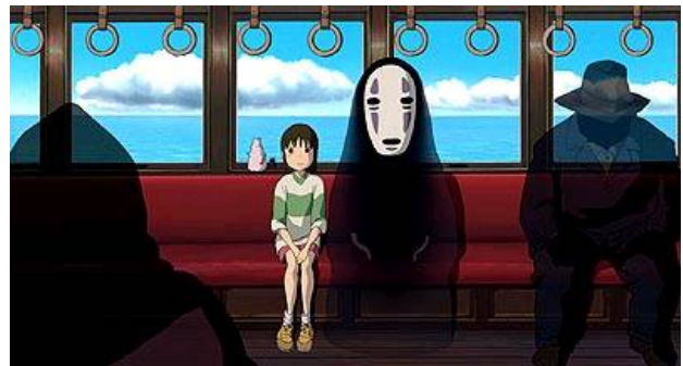
A scene from Spirited Away

both emotionally precise and fantastical. It’s like every solitary journey you’ve ever taken, when you felt lonely and a little exalted, but it is also deeply strange, for the train glides, stately and surreal, over a translucent blue sea, while the sky slowly ripples through the possibilities of a sunset, from the pink of crushed petals to a soft, forgiving black.