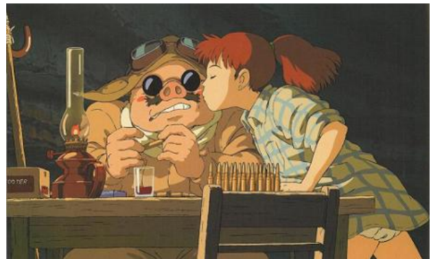
A scene from Porco Rosso

American distributor of Miyazaki’s films, will release a video version of “Porco,” whose title charter will be voiced by Michael Keaton. It will also make available an English version of “Nausicäa, with voices by Uma Thurman and Patrick Stewart. With these two releases, the entirety of Miyazaki’s eccentric output will be available in good English versions for the first time.