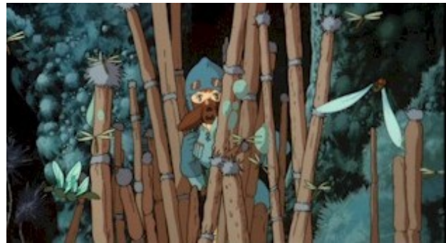
A scene from Nausicäa of the Valley of the Wind

preoccupation with the environment, and their not entirely metaphorical suggestion that the natural world is capable of remembering what’s been done to it. (He believes that we harbor “memories in our DNA from before we took the form of humans.”) “ Nausicäa of the Valley of the Wind ” (1984) is set in a post-apocalyptic world where humans live huddled on the edge of a toxic forest. Its heroine finds beauty in the lush, strangely colored undergrowth and the giant cicada-like insects that dwell there, nursing a grudge against the humans who’ve poisoned their habitat.