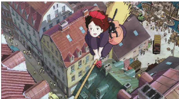
A scene from Kiki's Delivery Service

Miyazaki's producer and longtime collaborator. "When silents moved to talkies, Chaplin held out the longest," he told me. "When black-and-white went to color, Kurosawa held out the longest. Miyazaki feels he should be the one to hold out the longest when it comes to computer animation." Miyazaki lavishes particular attention on his backgrounds, which are full of painterly flourishes. I'd never really noticed the colors in an animated film until I noticed his. Skies and seas are saturated in strangely emotional blues; wet halos surround the red lantern and absinthe-green neon signs in "Spirited Away"; in "Kiki's Delivery Service," the young witch's dress isn't quite black—it's the smudged purple of the darkest plums.