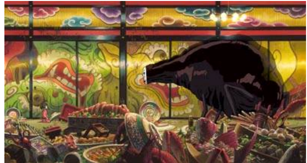
Chihiro encounters No Face in Spirited Away .

flash through the sky: they are like origami, only sharp-edged, and capable of drawing blood.