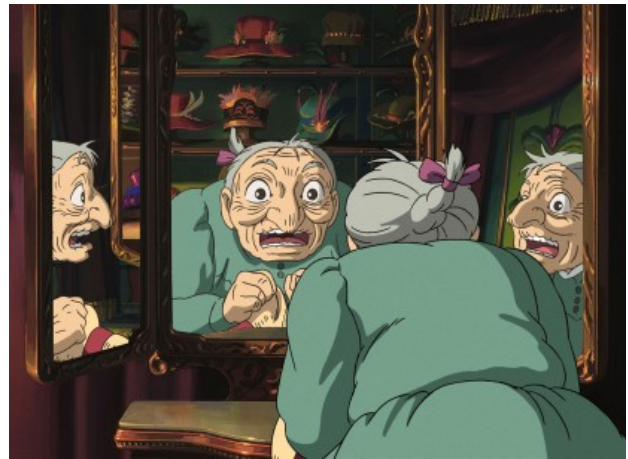
Sophie in Howl’s Moving Castle

when she actually is old, make a better grandma. Anyway, as Sophie gets older, she gets more pep. And she says what’s on her mind. She is transformed from a shy, mousy little girl into a blunt, honest woman. It’s not a motif you see often, and, especially with an old woman taking up the whole screen, it’s a big theatrical risk. But it’s a delusion that being young means you’re happy.”