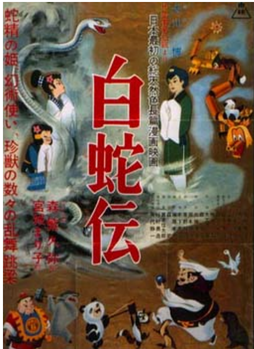
Poster for Legend of White Snakes

just started. Comparing my pitiful situation to the characters' earnestness, I was ashamed of myself, and cried all night." At the time, he had been trying to write a sophisticated, absurdist manga, but he realized, somewhat to his embarrassment, that he was more interested in creating something sincere.