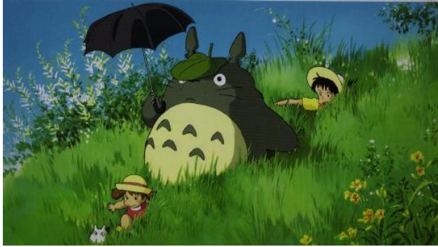
A scene from My Neighbor Totoro

The tone of the film is dreamy and playful—it has the sun-soaked colors and languid pace of a summer afternoon in the country—but the way it melds such elements with a subtle psychological treatment of the children’s anxiety over their mother makes it a radical film. When four-year-old Mei learns that her mother won’t be coming home for a visit as planned, her grief takes the form of a tantrum. She howls—her mouth a black cavern, her arms stiff. (In Disney movies, children weep decorously or break into poignant song.) Satsuki, panicked and struggling to be the mature sister, shouts at her not to be so “stupid”; Mei runs away to the hospital to find her mother. Both girls are ultimately rescued by the cat bus, which opens up a warm, golden, womb-like interior to them—an entrancing image of solace—and bounds across the countryside to return them to their father. Miyazaki is a master at conveying emotions as a child would experience them: obliquely, often physically, with a thread of magical thinking that promotes resilience.