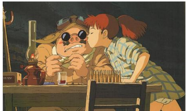
A scene from Porco Rosso

American distributor of Miyazaki’s films, will release a video version of “Porco,” whose title charter will be voiced by Michael Keaton. It will also make available an English version of “Nausicäa, with voices by Uma Thurman and Patrick Stewart. With these two releases, the entirety of Miyazaki’s eccentric output will be available in good English versions for the first time.