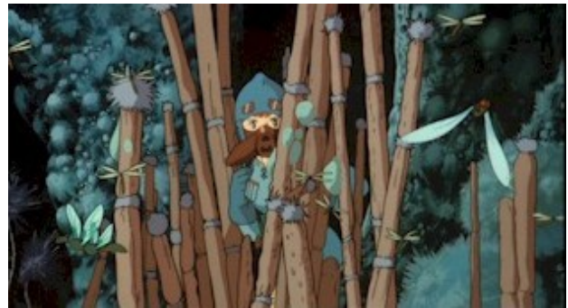
A scene from Nausicäa of the Valley of the Wind

preoccupation with the environment, and their not entirely metaphorical suggestion that the natural world is capable of remembering what’s been done to it. (He believes that we harbor “memories in our DNA from before we took the form of humans.”) “ Nausicäa of the Valley of the Wind ” (1984) is set in a post-apocalyptic world where humans live huddled on the edge of a toxic forest. Its heroine finds beauty in the lush, strangely colored undergrowth and the giant cicada-like insects that dwell there, nursing a grudge against the humans who’ve poisoned their habitat.