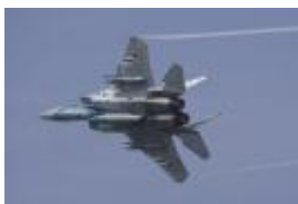
A Japanese F15 fighter

severe that pilots can only practice flying their planes for a few hours per year. Japan for its part has an army bigger than either the British or French, the 5th largest navy in the world (after the United States, Russia, China and the United Kingdom), and the twelfth largest air force in the world, larger than Israel's. It has 200 F15 fighters, 16 submarines (and builds one new one each year), four Aegis destroyers (and two more on order); and budgeted in 2004 for two 13,500-ton aircraft carriers (coily described as "helicopter carriers"). Behind Japan stands the military colossus of the United States. Moreover, Japan launched two reconnaissance satellites in March 2003 to spy on North Korea. Were North Korea to launch spy satellites into the skies above Tokyo or Osaka, a Japanese preemptive strike to get rid of them would no doubt follow quickly.