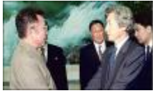
Kim Jong Il and Koizumi Junichiro in Pyongyang

More specifically, Kim admitted and apologized for the abduction between 1977 and 1982 of a group of Japanese civilians, among them a schoolgirl, a beautician, a cook, and three dating couples whisked away from remote Japanese beaches. In addition, North Korean agents – now believed to have been Japanese Red Army hijackers who settled in Pyongyang in 1970 – abducted three students who had been touring Europe and brought them to Pyongyang either to teach Japanese-language courses to intelligence agents or so that overseas operatives could appropriate their identities. Insisting that he had no personal knowledge of all this, Kim blamed the abductions on “some elements of a special agency of state” who were “carried away by fanaticism and desire for glory.”