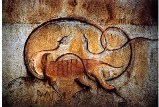
Figure 6: A snake crossed with a tortoise. Kansa Middle-sized Mound, 7th Century in the Kitora Tomb in Asukamura, Nara prefecture, Japan.

Koguryo's relics are highly regarded in the rivalry between China and Korea. This indicates that heritage constitutes an influential part of cultural hegemony in East Asia and also, a powerful part of the cultural and historical patrimony of the people, both in Korea and especially in the Northeast Provinces in China. Kang Hyun-sook (2004), professor of Ancient Art in South Korea, maintains the distinctiveness and influence of Koguryo culture in East Asia in underlining that the Koguryo tombs with murals were not mere imitation of their Chinese counterparts and that they were influenced by Japan's funerary culture. As examples of Koguryo's influence on Japan's funerary culture, the Takamatsu Tomb and the Kitora Tomb in Japan have been cited. [31] She concludes that the influence of Koguryo seen in Japan and the Korean peninsula demonstrates its prominent position as a culturally powerful regional state (Kang 2004: 106-107). As such, the Koguryo archaeological remains represent the legacy and hegemony of regional culture.