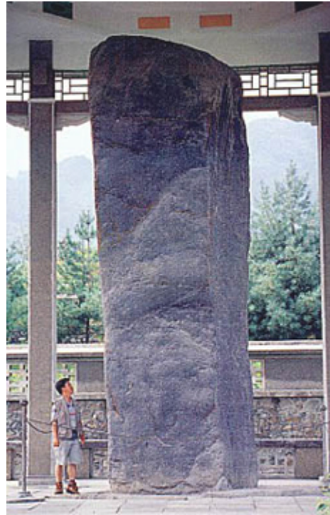
Figure 7: The King Kwanggaet’o stele in Ji’an, China

“core”. (Hobsbawm 1990) Mass support for cultural patriotism can be seen in response to efforts to preserve national heritage in China. “Relics protection prizes” were offered by the central government in Beijing in December 2003. The prizes were awarded to a total of 31 national level cultural relics authorities for their efforts to protect historical treasures. Ji’an Province where Koguryo archaeological remains are located was one of the award winners, boasting numerous cultural relics from the ancient Gaogouli ruins. [40] This mass support is probably related to recent “regionalism” in Chinese archaeology. Von Falkenhausen (1995: 200) notes the recent “paradigm shift to regionalism from centralism” in Chinese archaeology. This has not, however, undercut cultural nationalism. As he stresses, this regionalism encourages voluntary integration, instead of coercing unity from the centre. (von Falkenhausen 1995: 200, 215) The result is to assist the central government in gaining mass support in cultural patriotism, and to help the local population gain official support and legitimation. Koguryo’s archaeological findings from the border regions are correlated with the master narratives of national history, showing the historical and cultural integrity of the borderlands, thereby reinforcing national myths of unity.