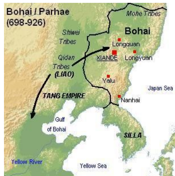
Figure 2: Map of Bohai/Parhae

“During the Sui and Tang, the Mohe lived along the Songhua and Heilong Rivers. In the second half of the seventh Century the Sumo-Mohe tribe grew stronger. At the end of the seventh century Da Zuurong, the leader of the Sumo, united all tribes and formed a government. Later the Tang Emperor Xuanzong proclaimed Da Zuurong King of the Bohai Commandery. After this proclamation, the Sumo-Mohe government called itself Bohai.” [3]