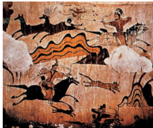
Figure 4 : A hunting scene in the Tomb Muyongchong, in Ji'an, located in contemporary Jilin Province, China.

with the Stone Monument of King Kwanggaet'o in China, have been put on the UNESCO World Heritage List. [29] The Koguryo relics have been co-registered as those of China and North Korea, thus fuelling the debate regarding the "rightful" ownership of the relics. The very next day, a South Korean NGO, Coalition for Peace and Historical Education in Asia ( Ashia p'yonghwawa yoksagyoyuk yondae ) expressed concern that this decision for co-registration made the question of who owns the legacy of Koguryo only fuels the controversy. [30] The syncretistic nature of culture has not been considered in this protest; only the competitive desire to monopolise the "national sites".