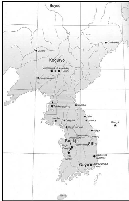
Figure 1 : Map of Koguryo/Gaogouli