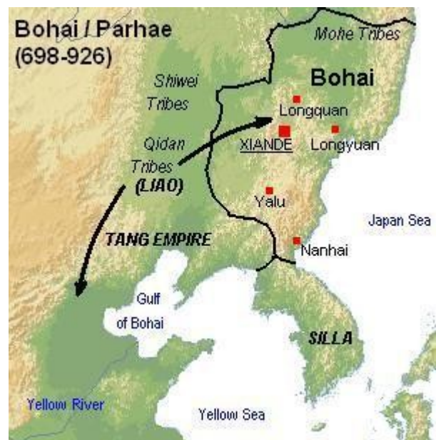
Figure 2: Map of Bohai/Parhae

“During the Sui and Tang, the Mohe lived along the Songhua and Heilong Rivers. In the second half of the seventh Century the Sumo-Mohe tribe grew stronger. At the end of the seventh century Da Zuurong, the leader of the Sumo, united all tribes and formed a government. Later the Tang Emperor Xuanzong proclaimed Da Zuurong King of the Bohai Commandery. After this proclamation, the Sumo-Mohe government called itself Bohai.” [3]