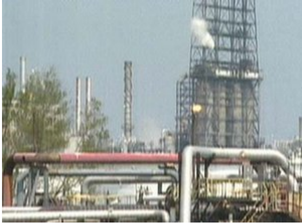
China-Iran Oil Deal