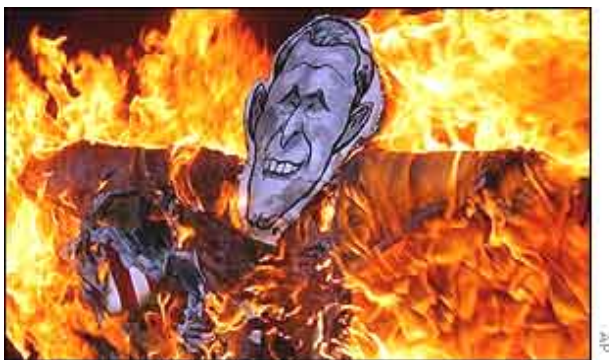
Anti-Bush demonstration in South Korea

administration that immediately placed North Korea policy on hold for 6 months and later made it clear that it would treat North Korea with suspicion, distrust and even hostility, proclaiming it a member of the “Axis of Evil”, thus in effect targeting the regime for overthrow. The end of the Cold War and Kim Dae-jung’s Sunshine Policy had implanted in the South Korean people’s hearts the possibility of imagining and even living in the post Korean War epoch. The Post Korean War can be seen as emblematic of the view that the North should no longer be seen as an enemy, the perpetrator of the Korean War, but as a brother to be embraced and helped. The end of the Cold War, a confidence born of South Korea’s rise as a regional power that contrasted dramatically with North Korea’s demise as well as the improving political situation during the Kim Dae-jung and Clinton administrations, made the concept of a unified Korea and the notion of pan Korean nationalism something achievable and tangible.