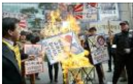
Anti-Japanese demonstration in South Korea

culture in Japan, especially movies, dramas and singers, have made Japanese the largest tourist group in South Korea. Thus the streets of Seoul and other key tourist destinations specialize in catering to Japanese visitors at a time of rising Korean antagonisms toward Japan. Fortunately anti-Japanism has not translated into violent action, but the sentiments are deep and strong and animated by long standing issues over colonial compensation especially over forced labor, comfort women and atom bomb victims,[11] the protection, privileged positions and aggrandizement by collaborators, the never ending dispute over Japanese history text books, the controversy over the Japanese Prime Minister's visits to Yasukuni Shrine, and most recently, over the Tokdo/Takeshima island sovereignty issue.