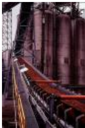
Zen-no Grain Corporation

The other side is arming itself with theories to defend creation of the limitless hunting preserve, as in calling for dismantling of Zen-noh (the National Federation of Agricultural Co-operative Associations). The other side rejects coexistence with cooperatives, let alone a mutually beneficial relationship. Zen-noh may have problems, but the important thing is to make necessary corrections in full awareness of the pressures of the times. A true crisis will ensue if this cannot be achieved. The first step is accurate recognition of current conditions.